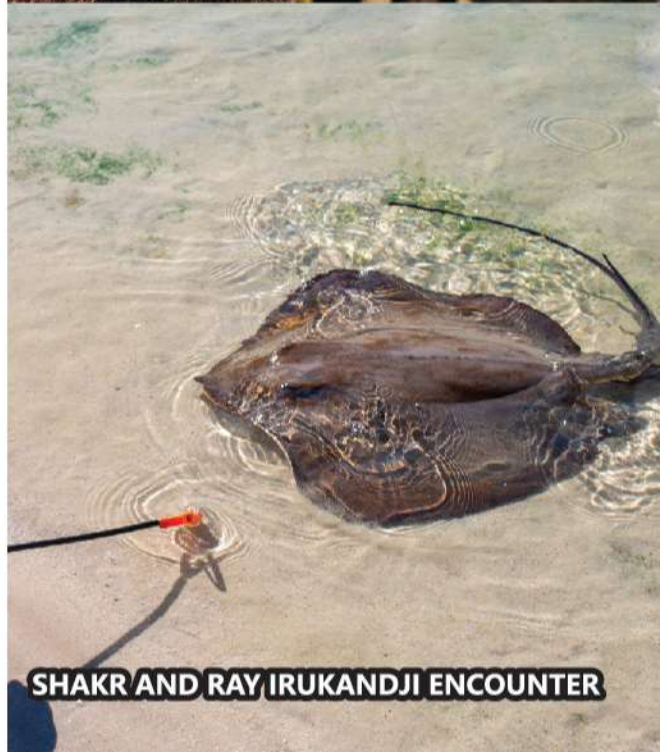
SHAKR AND RAY IRUKANDJI ENCOUNTER