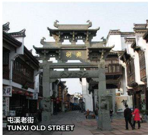
屯溪老街 TUNXI OLD STREET