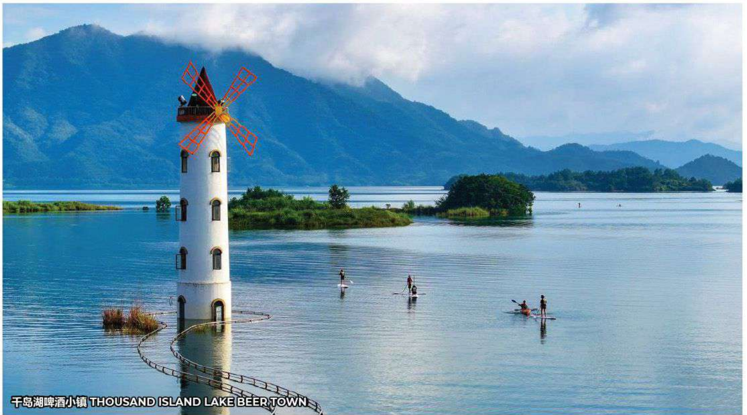
千岛湖啤酒小镇 THOUSAND ISLAND LAKE BEER TOWN