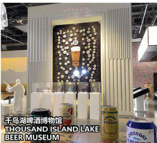
千岛湖啤酒博物馆 THOUSAND ISLAND LAKE BEER MUSEUM