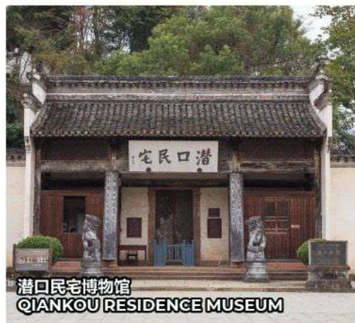
潜口民宅博物馆 QIANKOU RESIDENCE MUSEUM