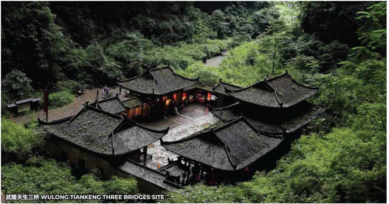
武隆天生三桥 WULONG TIANKENG THREE BRIDGES SITE