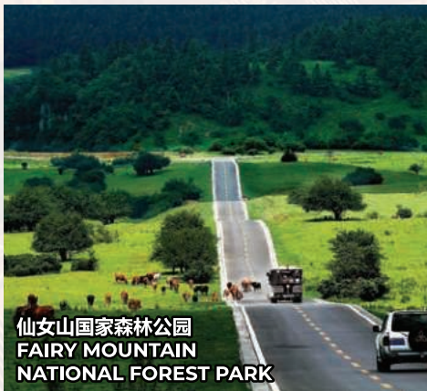
仙女山国家森林公园 FAIRY MOUNTAIN NATIONAL FOREST PARK