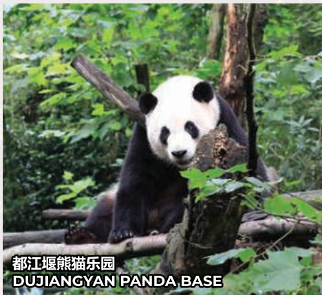
都江堰熊猫乐园 DUJIANGYAN PANDA BASE