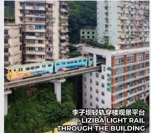
李子坝轻轨穿楼观景平台 LIZIBA LIGHT RAIL THROUGH THE BUILDING

Proceed to the airport for your flight back to Malaysia.