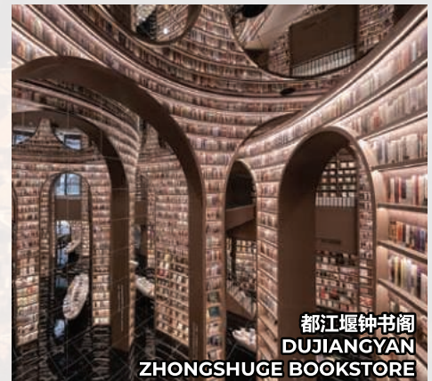
都江堰钟书阁 DUJIANGYAN ZHONGSHUGE BOOKSTORE