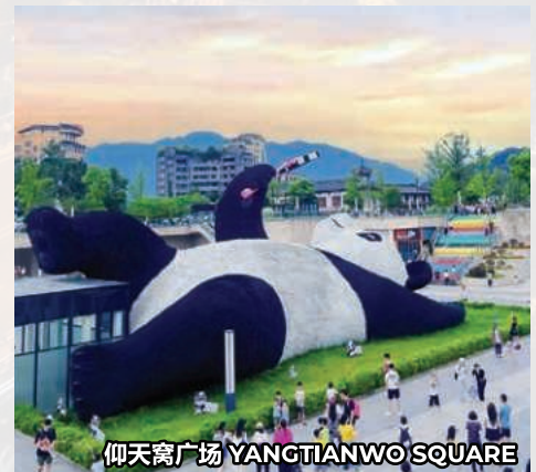
仰天窝广场 YANGTIANWO SQUARE