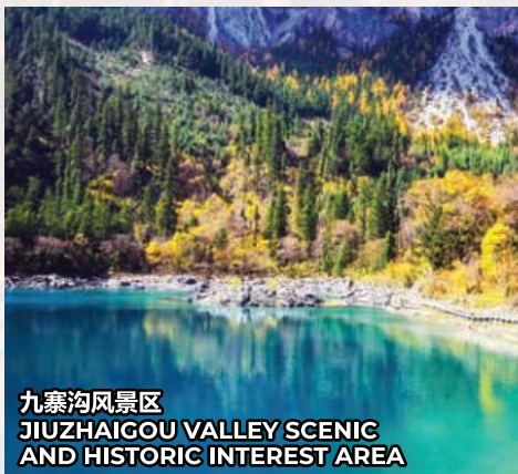
九寨沟风景区 JIUZHAIYOU VALLEY SCENIC AND HISTORIC INTEREST AREA