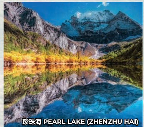
珍珠海 PEARL LAKE (ZHENZHU HAI)