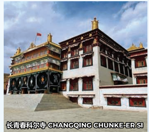
长春科尔寺 CHANGQING CHUNKE-ER SI

After breakfast, proceed to the airport for your flight back to Malaysia.