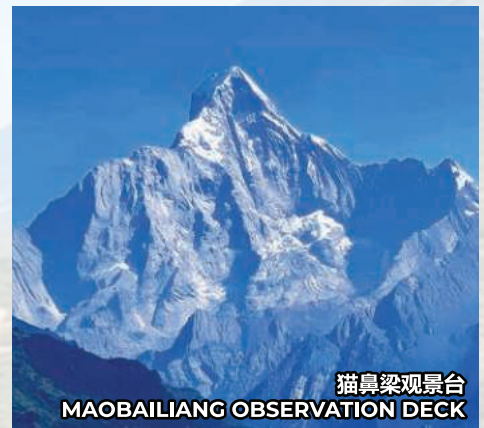
猫鼻梁观景台 MAOBAILIANG OBSERVATION DECK