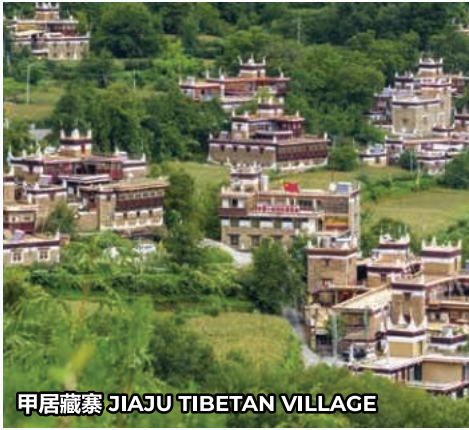
甲居藏寨 JIAJU TIBETAN VILLAGE