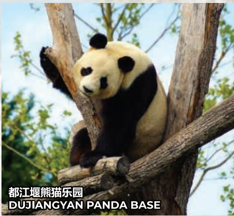
都江堰熊猫乐园 DUJIANGYAN PANDA BASE