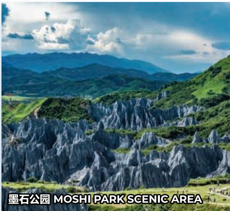
墨石公园 MOSHI PARK SCENIC AREA