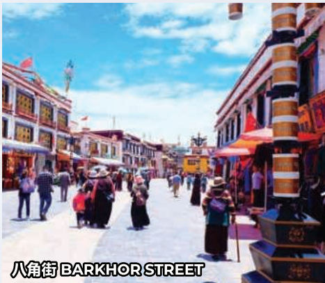
八角街 BARKHOR STREET