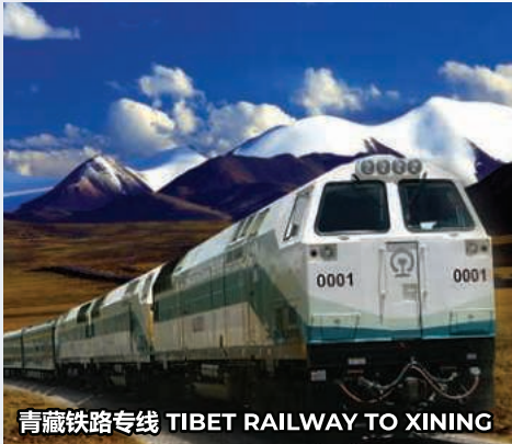
青藏铁路专线 TIBET RAILWAY TO XINING