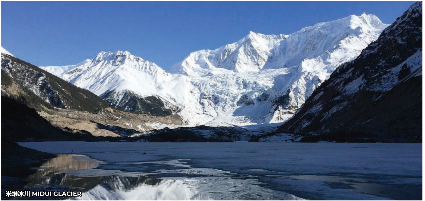
米堆冰川 MIDUI GLACIER