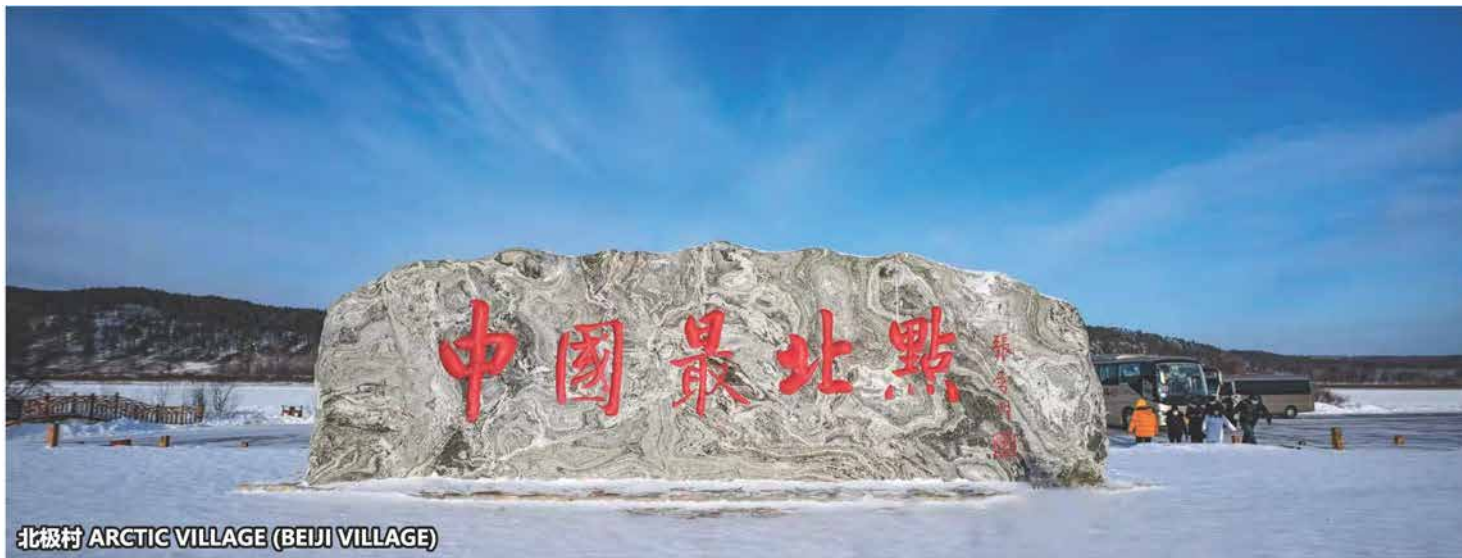
北极村 ARCTIC VILLAGE (BEIJI VILLAGE)