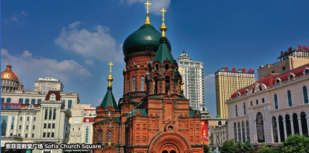
索菲亚教堂广场 Sofia Church Square