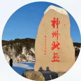
北极沙洲风景区 Arctic Sandbar Scenic Area

位于黑龙江省漠河市，黑龙江上游南岸，与俄罗斯阿穆尔州隔江相望，是中国最北的旅游景区，素有“神州北极”之美称。