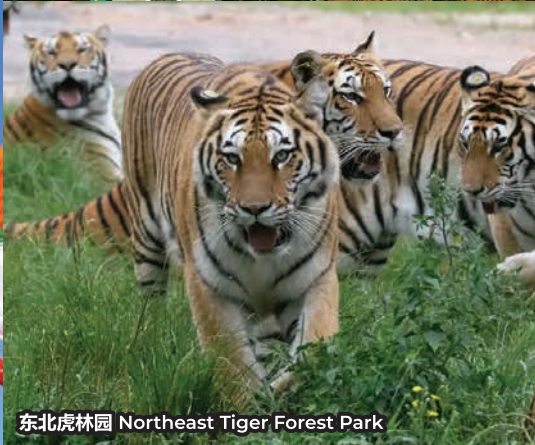
东北虎林园 Northeast Tiger Forest Park