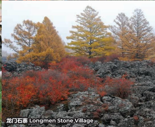
龙门石寨 Longmen Stone Village