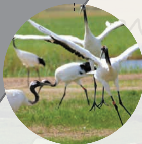
扎龙自然保护区 Zhalong Nature Reserve in Qiqihar

呼伦贝尔草原位于内蒙古自治区东北部，地处大兴安岭以西的呼伦贝尔高原上，因呼伦湖、贝尔湖而得名。