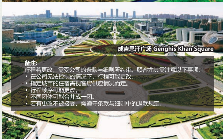
成吉思汗广场 Genghis Khan Square