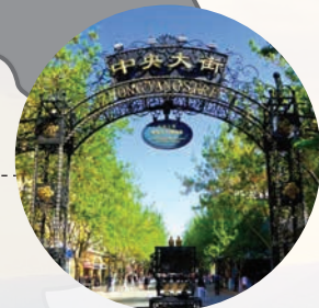
中央大街 Zhongyang Pedestrian Street

黑龙江扎龙国家级自然保护区是我国以鹤类等大型水禽为主的珍稀水禽分布区，是世界上最大的丹顶鹤繁殖地。