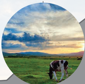
呼伦贝尔大草原 Hulunbuir Grassland

呼伦贝尔草原位于内蒙古自治区东北部，地处大兴安岭以西的呼伦贝尔高原上，因呼伦湖、贝尔湖而得名。