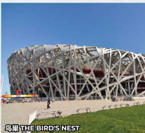
鸟巢 THE BIRD'S NEST