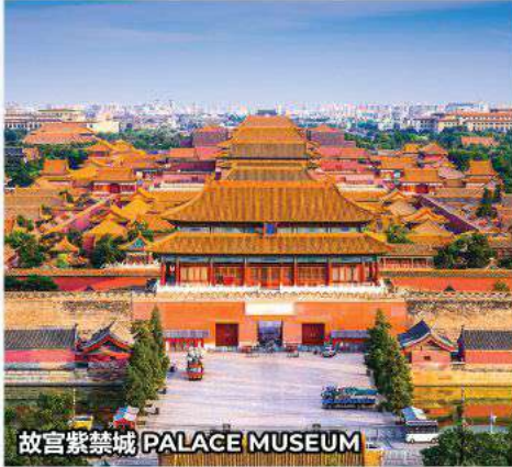
故宫紫禁城 PALACE MUSEUM