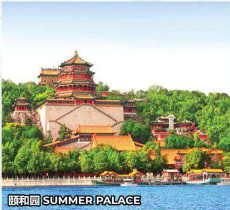
颐和园 SUMMER PALACE