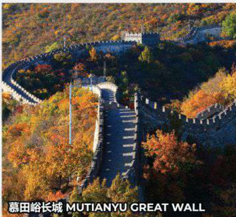
慕田峪长城 MUTIANYU GREAT WALL