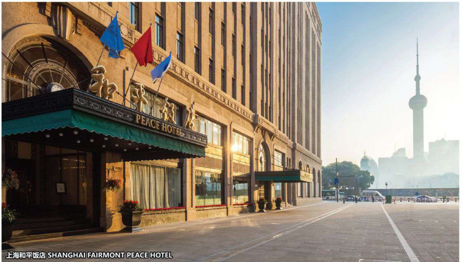
上海和平饭店 SHANGHAI FAIRMONT PEACE HOTEL