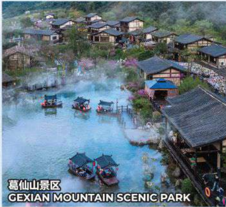
葛仙山景区 GEXIAN MOUNTAIN SCENIC PARK