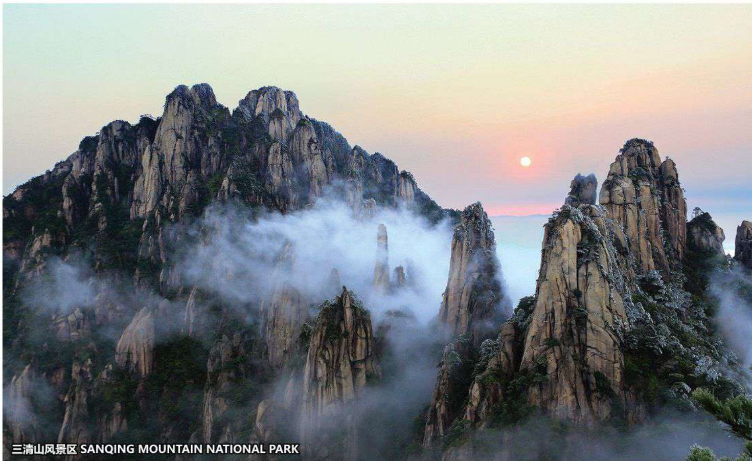
三清山风景区 SANQING MOUNTAIN NATIONAL PARK