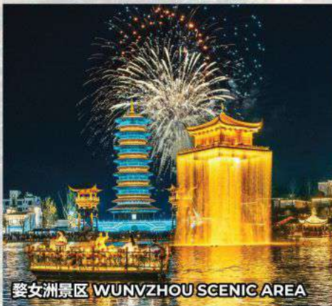
婺女洲景区 WUNVZHOU SCENIC AREA