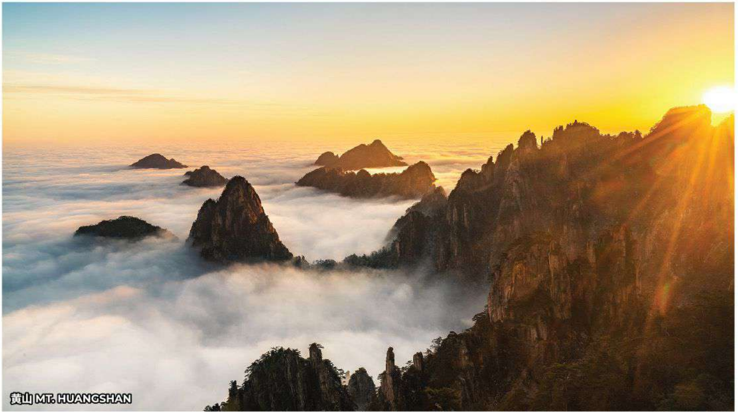
黄山 MT. HUANGSHAN