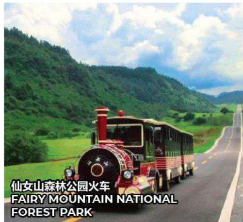
仙女山森林公园火车 FAIRY MOUNTAIN NATIONAL FOREST PARK