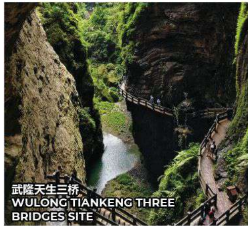
武隆天生三桥 WULONG TIANKENG THREE BRIDGES SITE