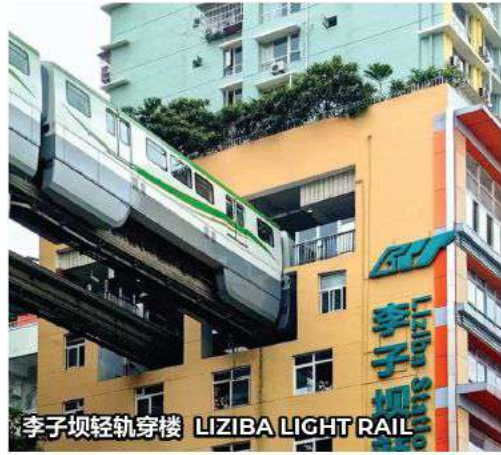
李子坝轻轨穿楼 LIZIBA LIGHT RAIL