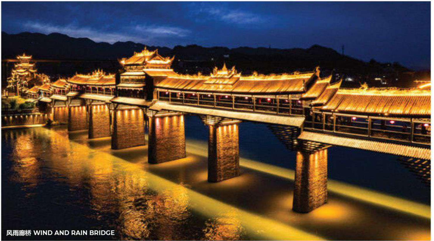
风雨廊桥 WIND AND RAIN BRIDGE