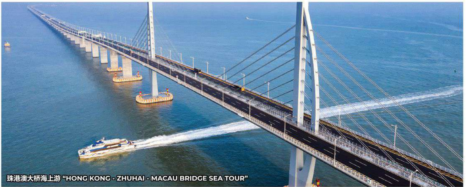
珠港澳大桥海上游 "HONG KONG - ZHUHAI - MACAU BRIDGE SEA TOUR"