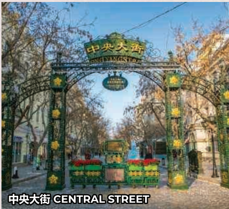
中央大街 CENTRAL STREET

备注： 行程若更改，需受公司的条款与细则所约束。 顾客尤其需注意以下事项：(1) 在公司无法控制的情况下，行程可能更改。(2) 指定城市的住宿需视客房供应情况而定。(3) 行程顺序可能更改。(4) 不同团体可能合并成一团。(5) 若有更改不被接受，需遵守条款与细则中的退款规定。