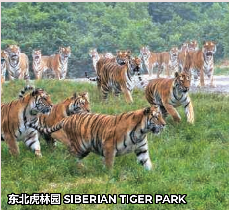
东北虎林园 SIBERIAN TIGER PARK