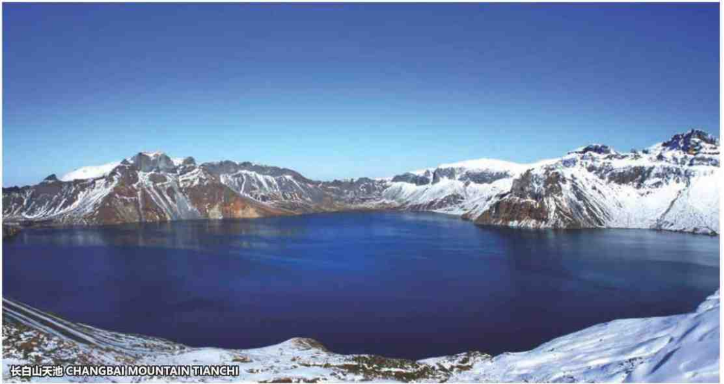
长白山天池 CHANGBAI MOUNTAIN TIANCHI