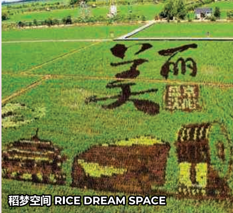
稻梦空间 RICE DREAM SPACE