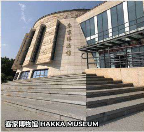
客家博物馆 HAKKA MUSEUM