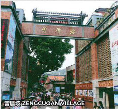
曾厝垵 ZENGCUOAN VILLAGE