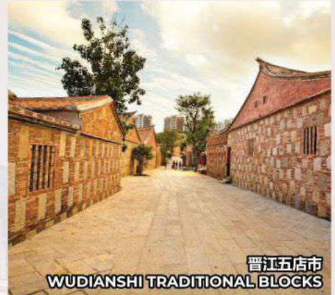
晋江五店市 WUDIANSHI TRADITIONAL BLOCKS

Hotel: Howard Johnson Changsheng Plaza or Similar*