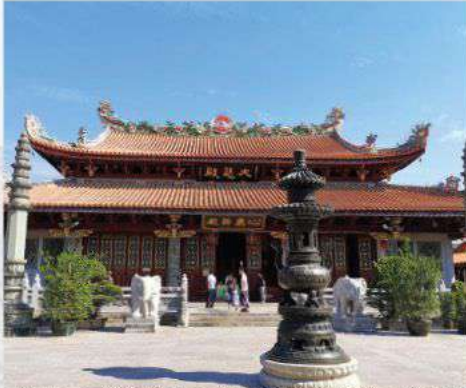
潮州开元寺 CHAOZHOU KAIYUAN TEMPLE