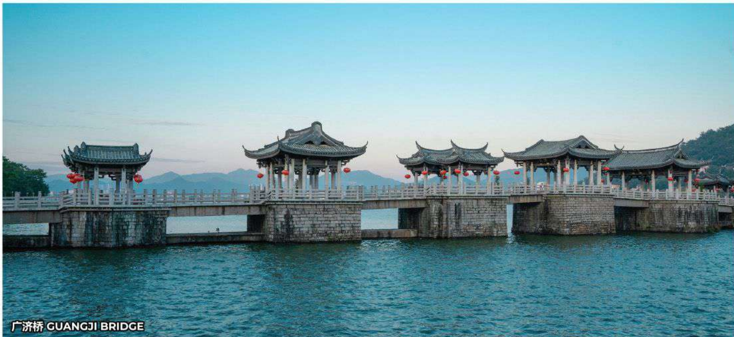
广济桥 GUANGJI BRIDGE