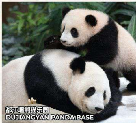
都江堰熊猫乐园 DUJIANGYAN PANDA BASE