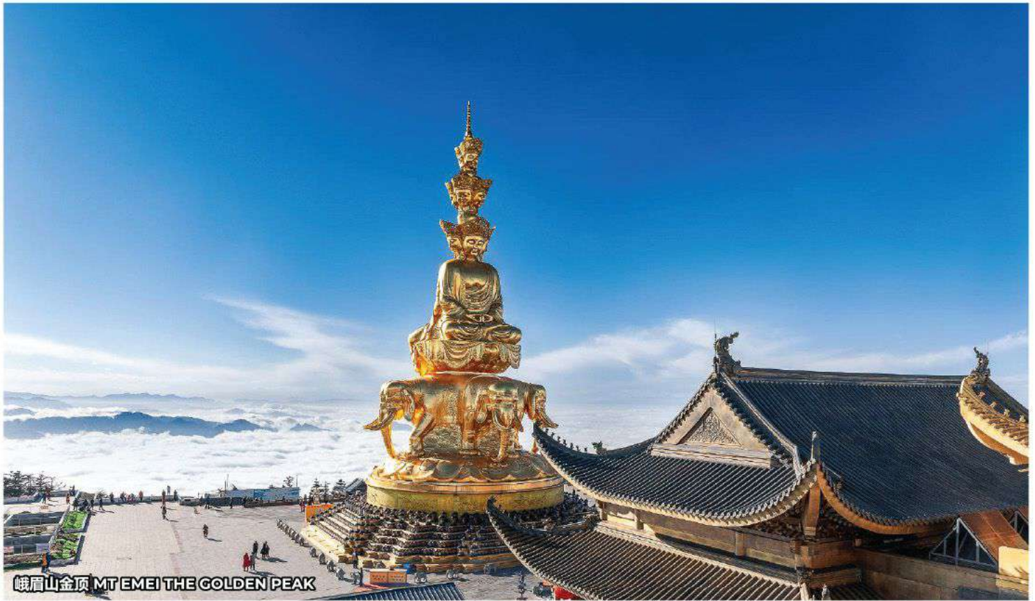
峨眉山金顶 MT EMEI THE GOLDEN PEAK