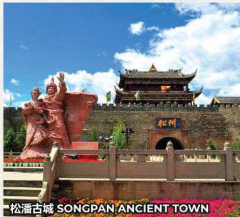
松潘古城 SONGPAN ANCIENT TOWN