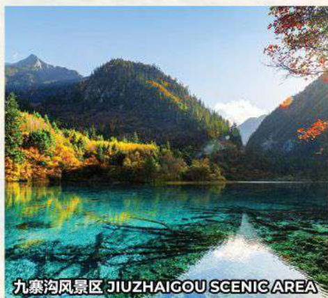
九寨沟风景区 JIUZHAIGOU SCENIC AREA