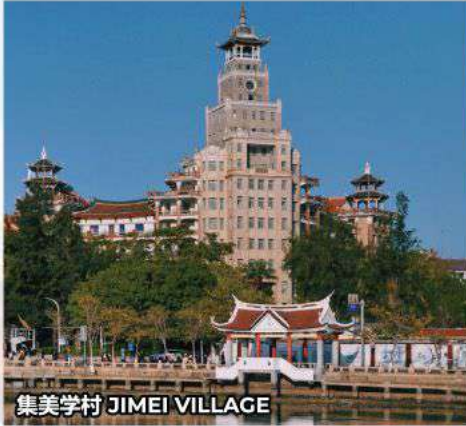
集美学村 JIMEI VILLAGE