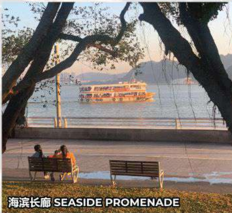
海滨长廊 SEASIDE PROMENADE