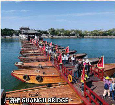
广济桥 GUANGJI BRIDGE