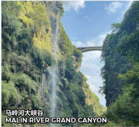
马岭河大峡谷 MALIN RIVER GRAND CANYON