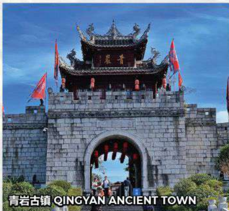
青岩古镇 QINGYAN ANCIENT TOWN

早餐后，乘船游万峰湖和外观位于万峰湖畔的吉隆堡，借助得天独厚的自然条件，使得吉隆堡村环抱于山水之中。这里风光秀美，加之哥特式风格建筑的城堡，更有“中国版天鹅堡”之称，非常适合拍照。午餐后，游览旷世奇峰万峰林（含观光车），万峰林由成千上万座奇峰组成，欣赏神秘的“八卦田”（3月-4月可观油菜花海），被不少专家和游人誉为“天下奇观”。 酒店：兴义梦乐城酒店或同级*