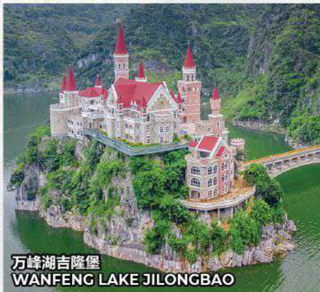
万峰湖吉隆堡 WANFENG LAKE JILONGBAO

备注： 行程若更改，需受公司的条款与细则所约束。 顾客尤其需注意以下事项：(1)在公司无法控制的情况下，行程可能更改。(2)指定城市的住宿需视客房供应情况而定。(3)行程顺序可能更改。(4)不同团体可能合并成一团。(5)若有更改不被接受，需遵守条款与细则中的退款规定。