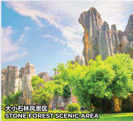
大小石林风景区 STONE FOREST SCENIC AREA