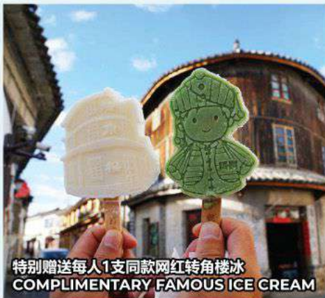
特别赠送每人1支同款网红转角楼冰 COMPLIMENTARY FAMOUS ICE CREAM