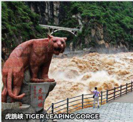
虎跳峡 TIGER LEAPING GORGE