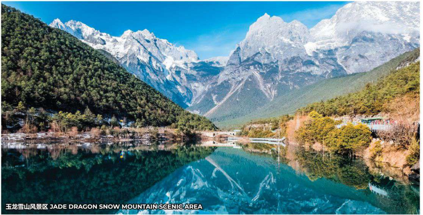
玉龙雪山风景区 JADE DRAGON SNOW MOUNTAIN SCENIC AREA