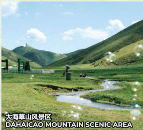
大海草山风景区 DAHAICAO MOUNTAIN SCENIC AREA