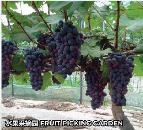
水果采摘园 FRUIT PICKING GARDEN