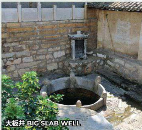
大板井 BIG SLAB WELL