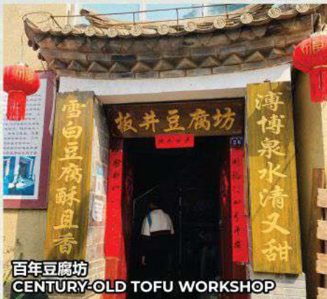
百年豆腐坊 CENTURY-OLD TOFU WORKSHOP