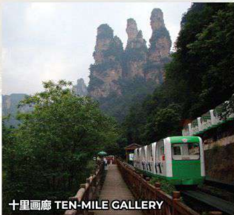
十里画廊 TEN-MILE GALLERY