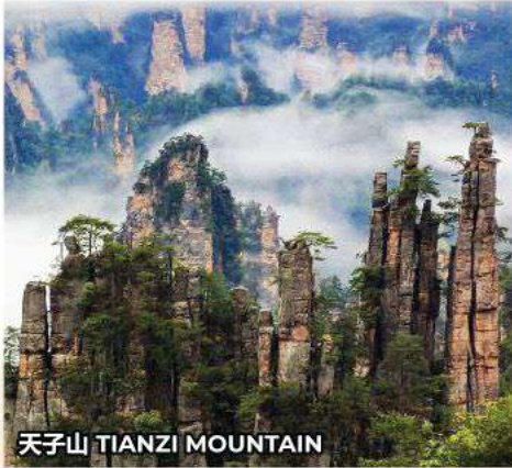
天子山 TIANZI MOUNTAIN