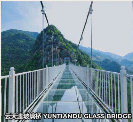
云天渡玻璃桥 YUNTIANDU GLASS BRIDGE