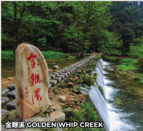
金鞭溪 GOLDEN WHIP CREEK