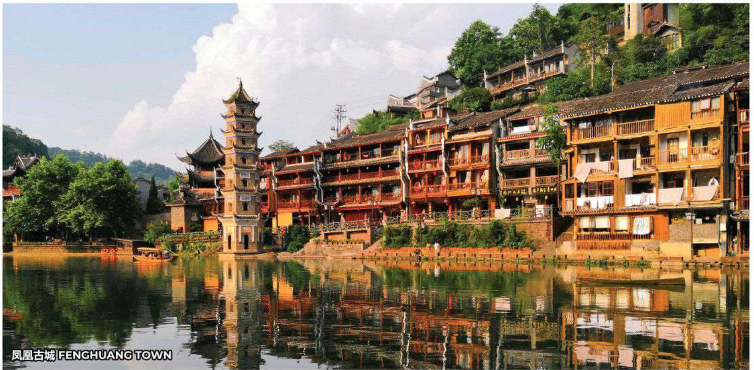
凤凰古城 FENGHUANG TOWN