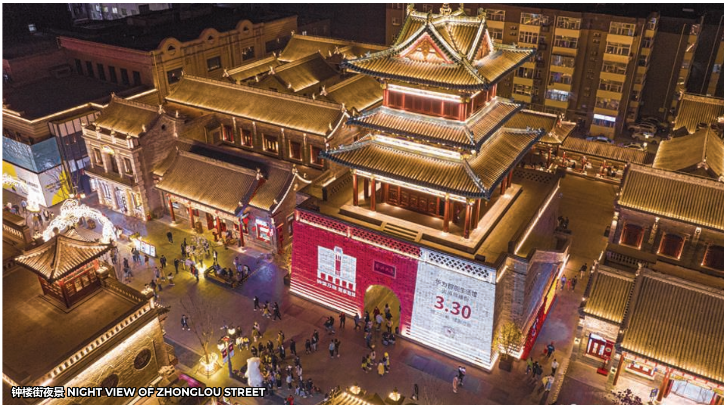
钟鼓楼夜景 NIGHT VIEW OF ZHONGLOU STREET