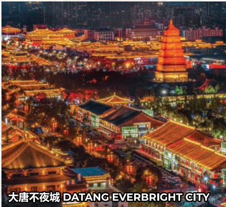
大唐不夜城 DATANG EVERBRIGHT CITY