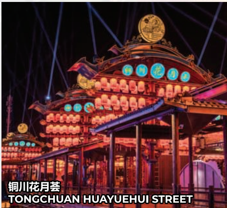
铜川花月荟 TONGCHUAN HUAYUEHUI STREET

备注： 行程若更改，需受公司的条款与细则所约束。 顾客尤其需注意以下事项：(1) 在公司无法控制的情况下，行程可能更改。(2) 指定城市的住宿需视客房供应情况而定。(3) 行程顺序可能更改。(4) 不同团体可能合并成一团。(5) 若有更改不被接受，需遵守条款与细则中的退款规定。