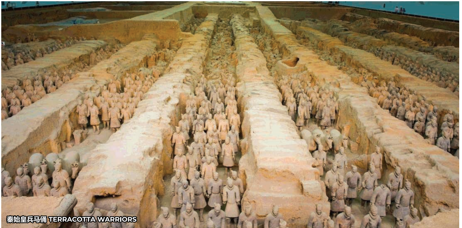
秦始皇兵马俑 TERRACOTTA WARRIORS