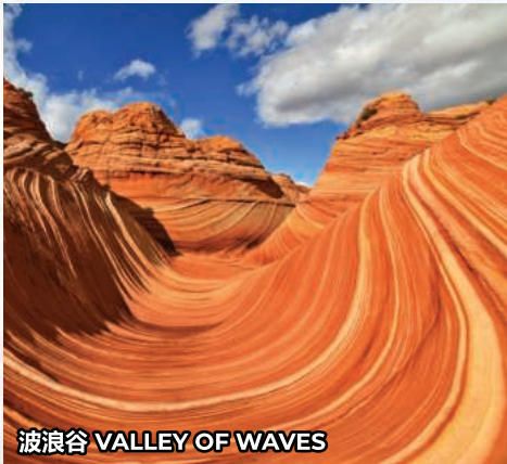
波浪谷 VALLEY OF WAVES