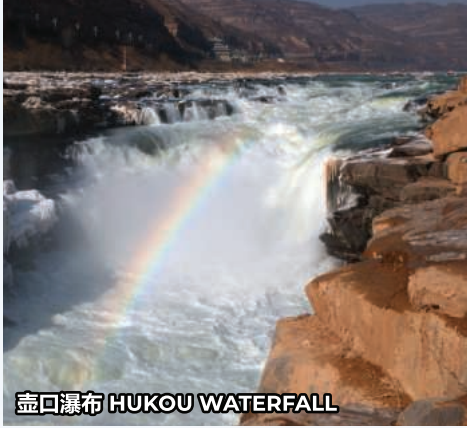
壶口瀑布 HUKOU WATERFALL