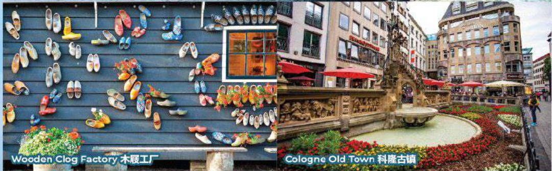
Wooden Clog Factory 木屐工厂