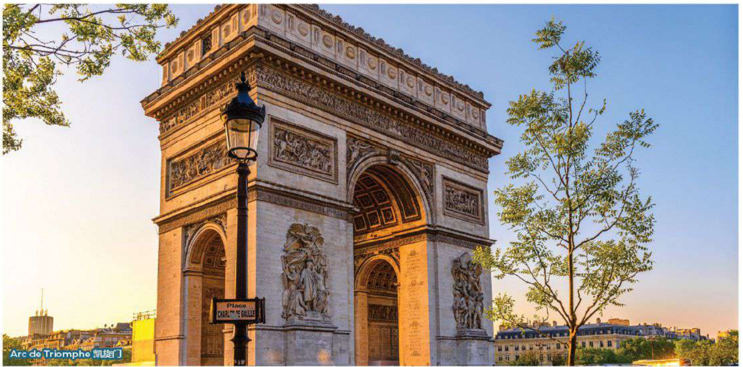
Arc de Triomphe 凯旋门