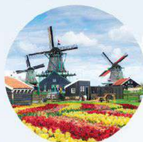
Zaanse Schans 风车村

An iconic symbol and museum, showcasing a magnified iron crystal. Built for the 1958 World's Fair, it represents scientific progress and modern architecture.