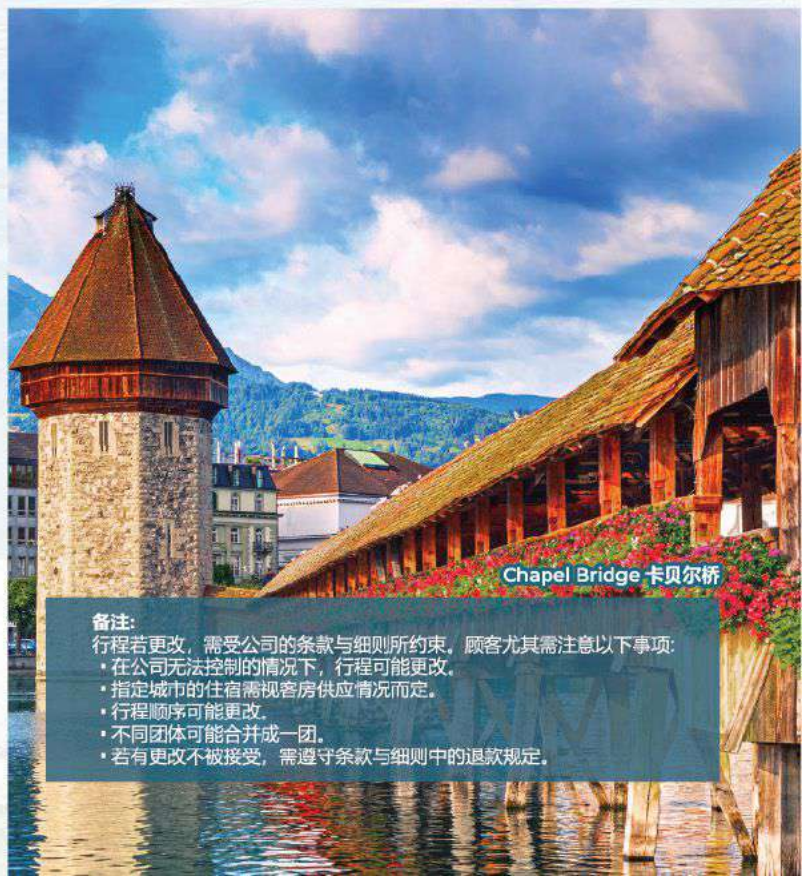
Chapel Bridge 卡贝尔桥