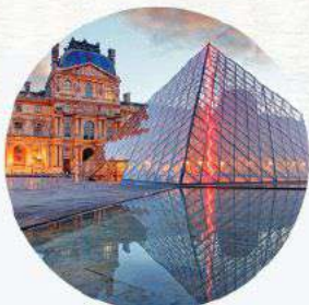
Louvre Museum 卢浮宫博物馆

Situated in the heart of Frankfurt, which offers a captivating blend of history and charm in the historic square with picturesque medieval architecture and iconic half-timbered houses.