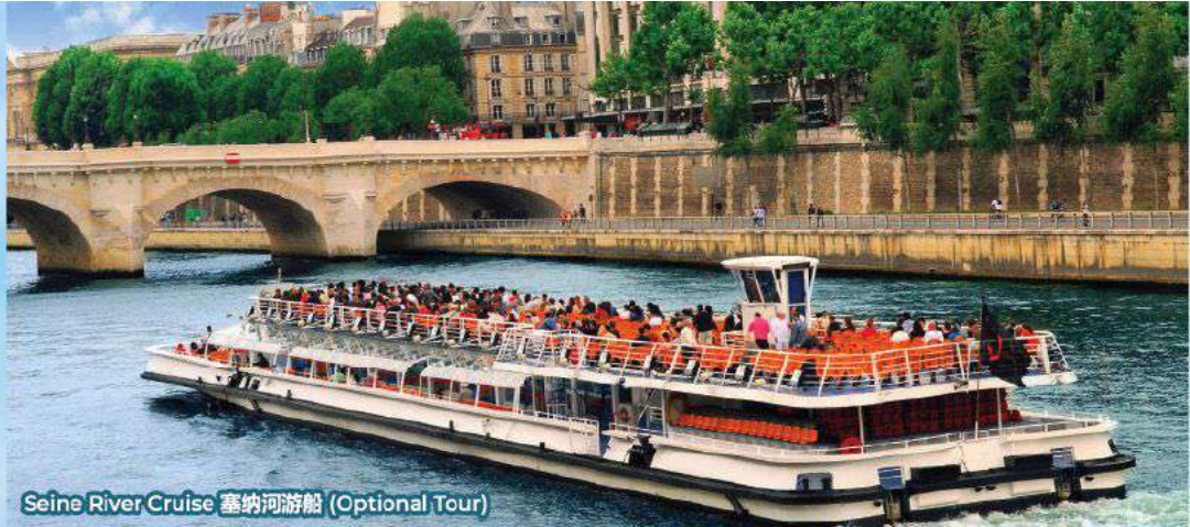
Seine River Cruise 塞纳河游船 (Optional Tour)