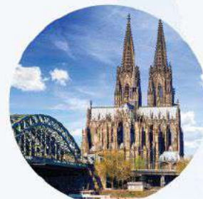
Cologne Cathedral 科隆大教堂

An open-air museum featuring historic windmills and traditional crafts, offering a charming glimpse into Dutch history.