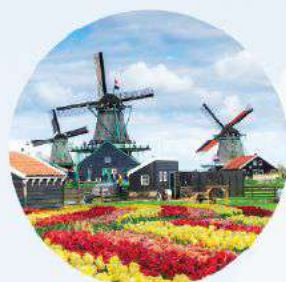
Zaanse Schans 风车村

An iconic symbol and museum, showcasing a magnified iron crystal. Built for the 1958 World's Fair, it represents scientific progress and modern architecture.