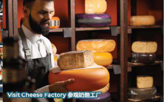
Visit Cheese Factory 参观奶酪工厂