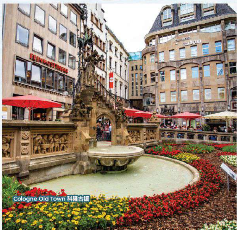
Cologne Old Town 科隆古镇