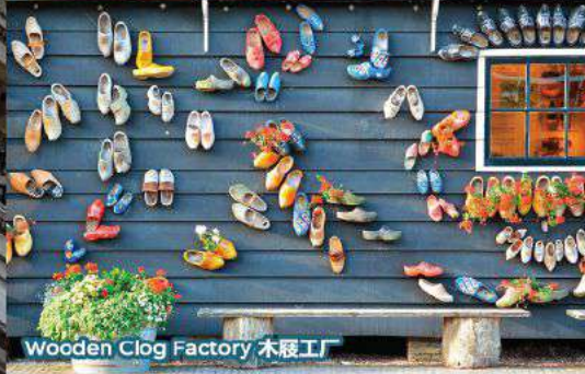
Wooden Clog Factory 木屐工厂