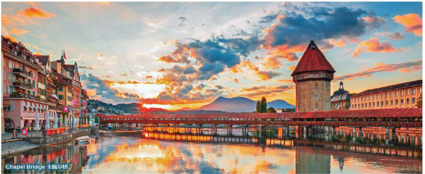
Chapel Bridge 卡佩尔桥