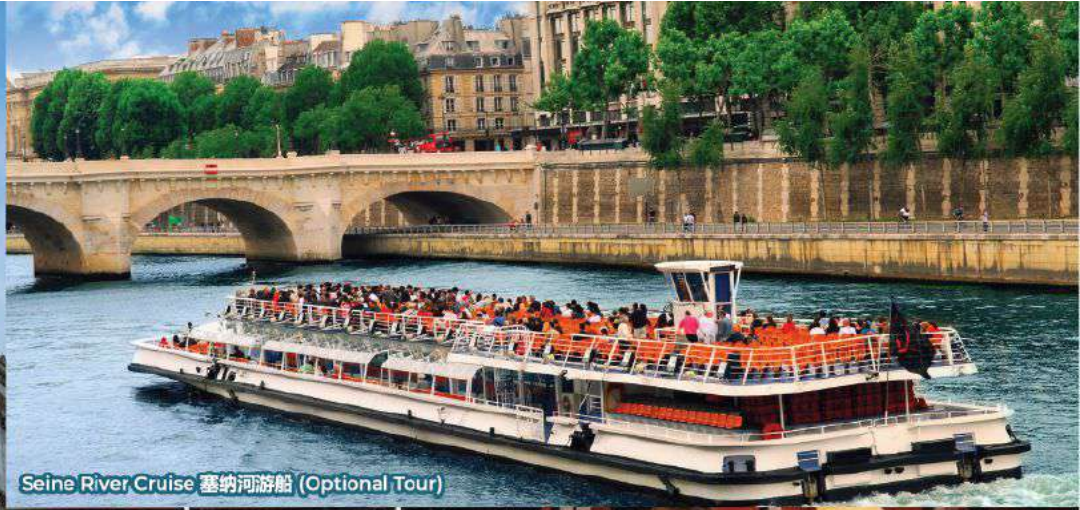
Seine River Cruise 塞纳河游船 (Optional Tour)