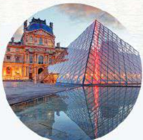
Louvre Museum 卢浮宫博物馆

Situated in the heart of Frankfurt, which offers a captivating blend of history and charm in the historic square with picturesque medieval architecture and iconic half-timbered houses.