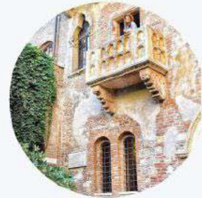
Juliet's Balcony 朱丽叶的阳台

A historic shopping arcade featuring luxury brands and captivating architecture.