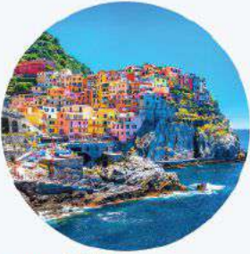
Cinque Terre 五渔村

A UNESCO site, enchants with colorful villages, coastal beauty, and clear waters, providing an idyllic Italian escape.