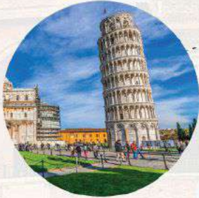
Leaning Tower Pisa 比萨斜塔

An iconic Italian landmark known for its unintentional tilt, part of the stunning Cathedral Square ensemble.