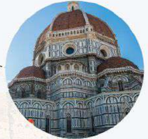
Cathedral of Santa Maria Del Fiore 圣母百花圣殿

An iconic Italian landmark known for its unintentional tilt, part of the stunning Cathedral Square ensemble.