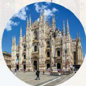
Duomo di Milano 米兰大教堂

A masterpiece of Gothic architecture with its iconic dome dominating the skyline.