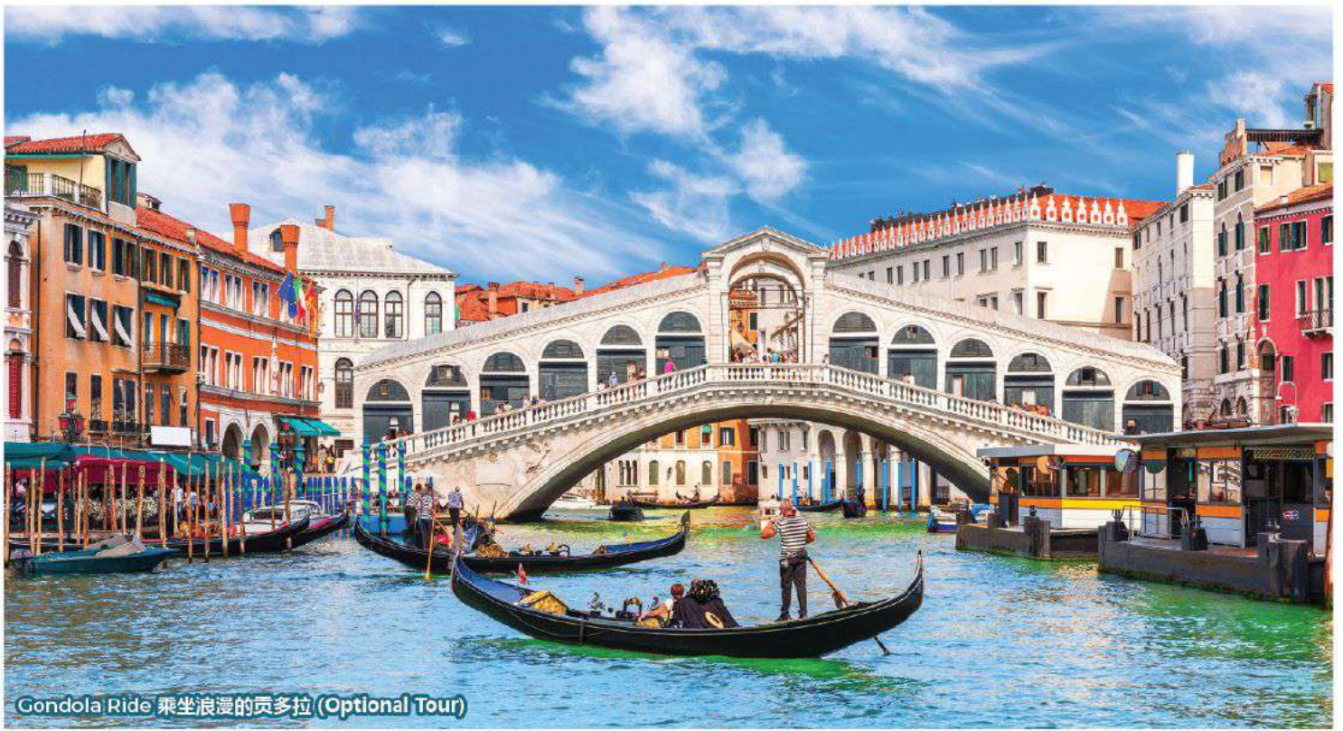
Gondola Ride 乘坐浪漫的贡多拉 (Optional Tour)