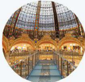
Galleria Vittorio Emanuele II 埃马努埃莱二世拱廊

A UNESCO site, enchants with colorful villages, coastal beauty, and clear waters, providing an idyllic Italian escape.