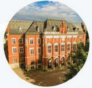
Jagiellonian University 雅盖隆大学

Iconic fortress with stunning architecture, overlooking Prague's skyline and the Vltava River.