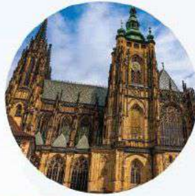
Prague Castle 布拉格城堡

Iconic fortress with stunning architecture, overlooking Prague's skyline and the Vltava River.