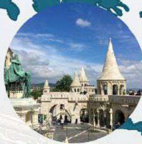
Fisherman's Bastion 渔人堡

Vienna's imperial residence with stunning gardens, a UNESCO site, and rich history.