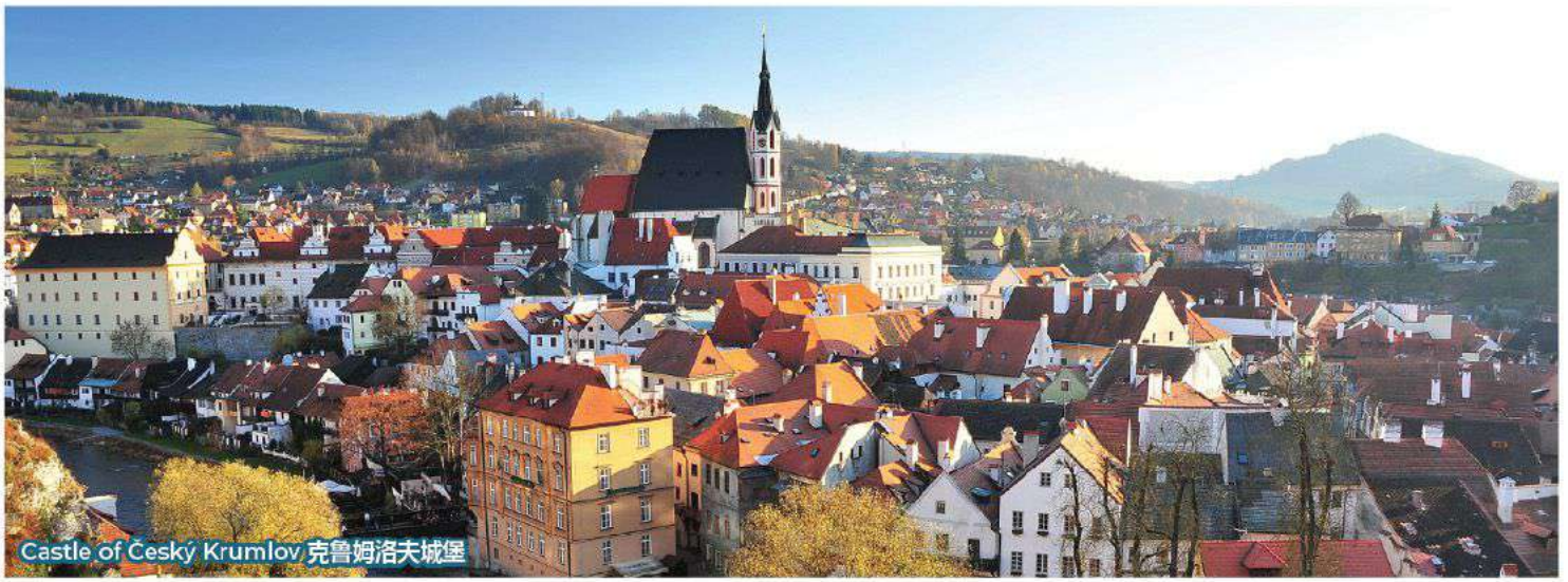
Castle of Český Krumlov 克鲁姆洛夫城堡