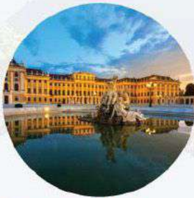
Schonbrunn Palace 美泉宫

Vienna's imperial residence with stunning gardens, a UNESCO site, and rich history.