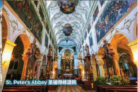
St. Peter's Abbey 圣彼得修道院