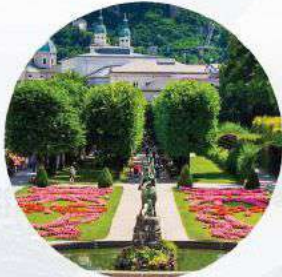
Mirabell Garden 米拉贝尔花园

Poland's oldest university, renowned for academic excellence and historic significance in Kraków.