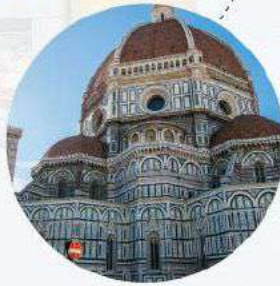
Cathedral of Santa Maria Del Fiore 圣母百花圣殿

An iconic Italian landmark known for its unintentional tilt, part of the stunning Cathedral Square ensemble.