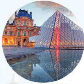
Louvre Museum 卢浮宫博物馆

A historic palace turned art museum, showcasing a vast collection from ancient to contemporary times. Renowned works like the Mona Lisa make it a symbol of timeless human artistic achievement.