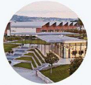
The Mall Luxury Outlet 托斯卡纳购物中心

A premier shopping haven surrounded by the beauty of the Italian countryside.