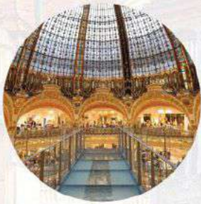
Galleria Vittorio Emanuele II 埃马努埃莱二世拱廊

Often called the "Top of Europe," offers breathtaking views of the Swiss Alps from its high-altitude railway station.