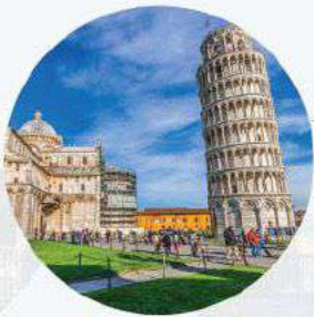
Leaning Tower Pisa 比萨斜塔

A premier shopping haven surrounded by the beauty of the Italian countryside.