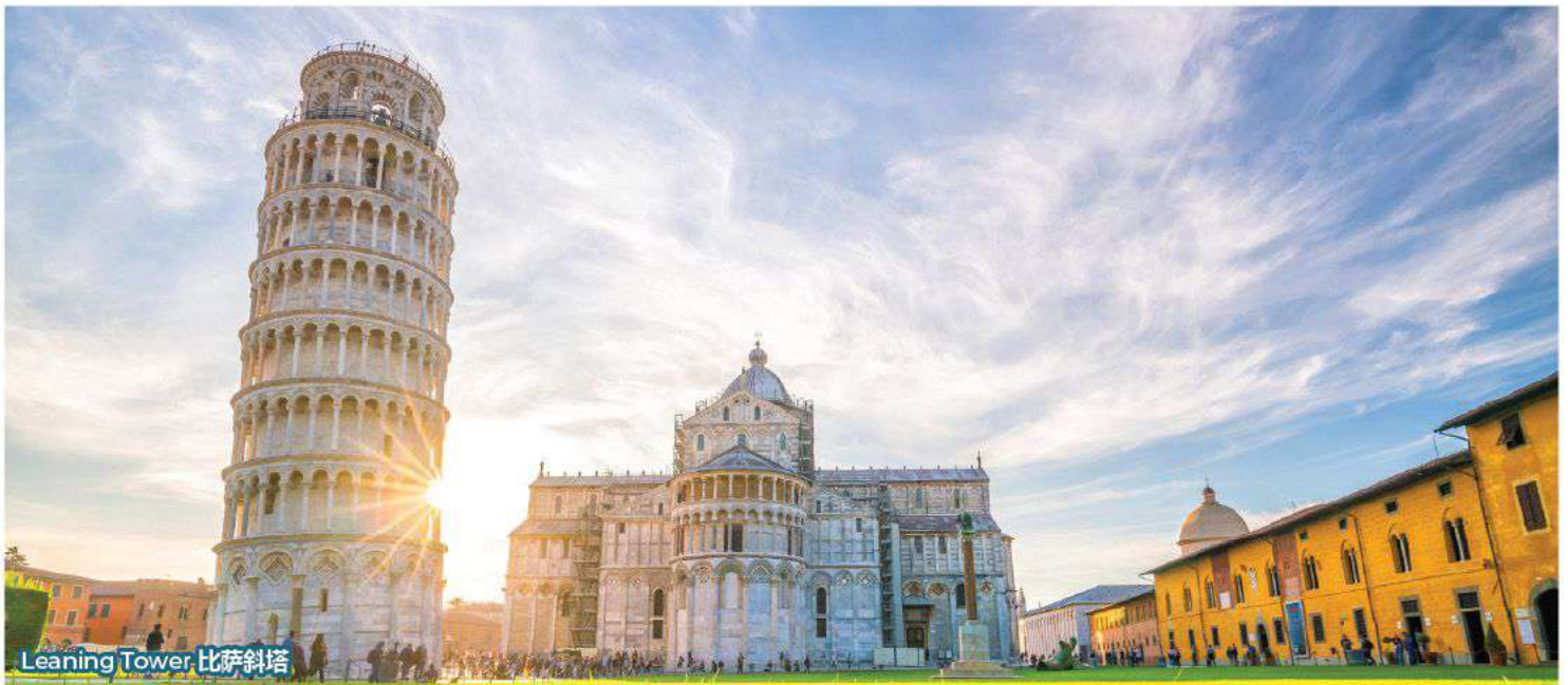
Leaning Tower 比萨斜塔