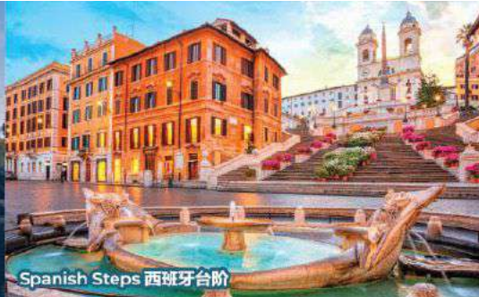
Spanish Steps 西班牙台阶