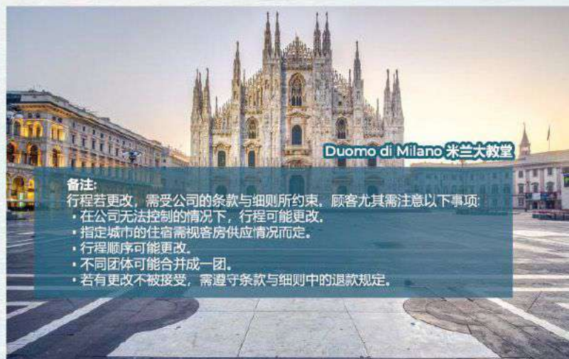
Duomo di Milano 米兰大教堂