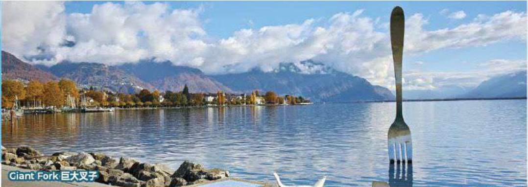
Giant Fork 巨大叉子