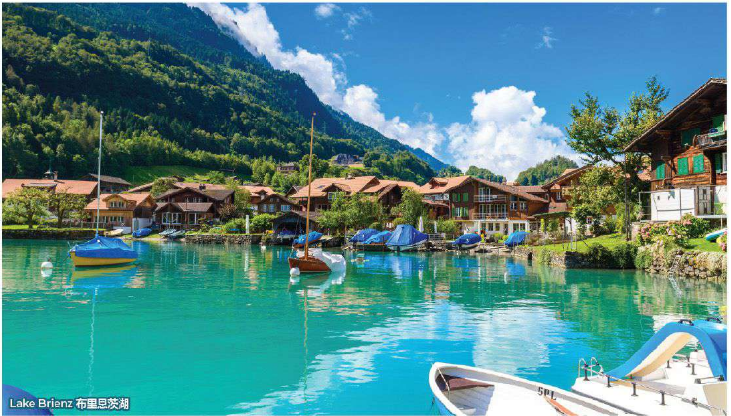
Lake Brienz 布里恩茨湖