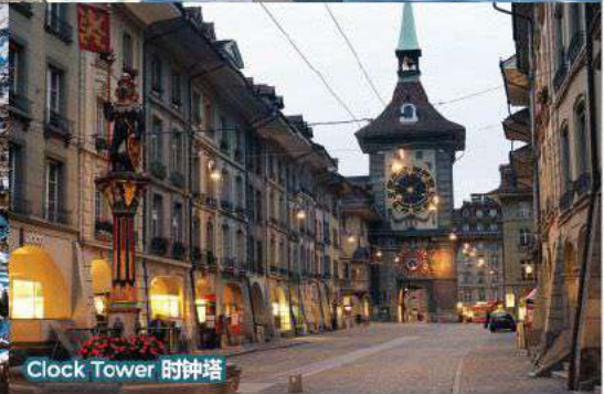
Clock Tower 时钟塔