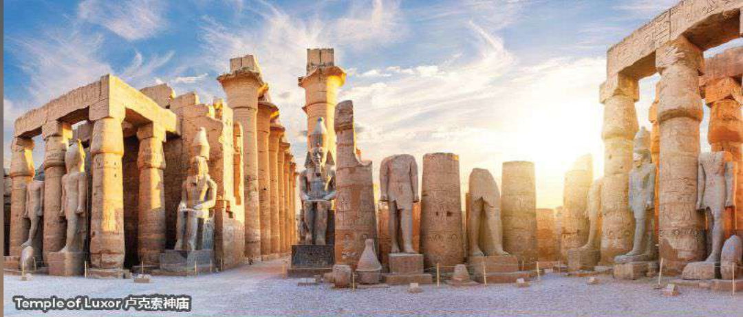
Temple of Luxor 卢克索神庙