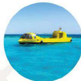
Optional Tour Submarine 潜水艇旅游

The Muhammad Ali Mosque or Alabaster Mosque is a mosque situated in the Citadel of Cairo in Egypt and was commissioned by Muhammad Ali Pasha between 1830 and 1848