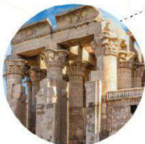
Temple of Kom Ombo 康翁布神庙

Hop on a kalesh ride, an Egyptian horse-drawn carriage, to visit the Temple of Horus, the best preserved ancient temple in Egypt.