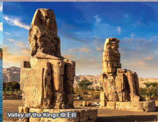
Valley of the Kings 帝王谷