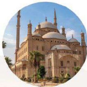
Mohamed Ali Mosque 穆罕默德阿里清真寺

Khan el-Khalili is a famous bazaar and souq in the historic center of Cairo, Egypt. Established as a center of trade in the Mamluk era and named for one of its several historic caravanserais, the bazaar district has since become one of Cairo's main attractions for tourists and Egyptians alike.