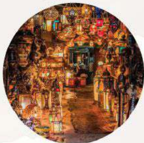
Khan El-Khalili 坎阿卡利市集

Khan el-Khalili is a famous bazaar and souq in the historic center of Cairo, Egypt. Established as a center of trade in the Mamluk era and named for one of its several historic caravanserais, the bazaar district has since become one of Cairo's main attractions for tourists and Egyptians alike.