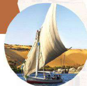
Elephantine Island On A Traditional Felucca Ride 传统的费卢卡船畅游象岛

Hop on a kalesh ride, an Egyptian horse-drawn carriage, to visit the Temple of Horus, the best preserved ancient temple in Egypt.