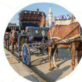
Kalesh Ride 埃及马车

The one & only real submarines in North Africa & Middle East. There are only 14 real recreational submarines worldwide, and two are right here in Hurghada, Egypt.