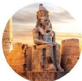
Temple of Luxor 路克索神庙

Hop on a kalesh ride, an Egyptian horse-drawn carriage, to visit the Temple of Horus, the best preserved ancient temple in Egypt.