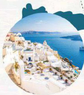
Fira town 费拉小镇

Platis Gialos is a lively village and resort anchored by its namesake beach, a sandy stretch in a sheltered bay lined with waterfront bars, tavernas, and seafood restaurants.