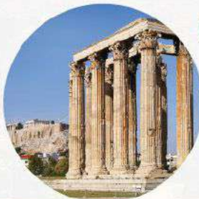
Temple of Olympian Zeus 奥林匹亚宙斯神庙

Little Venice is a charming part of Mykonos. The water lapping up on the building is reminiscent of Venice.