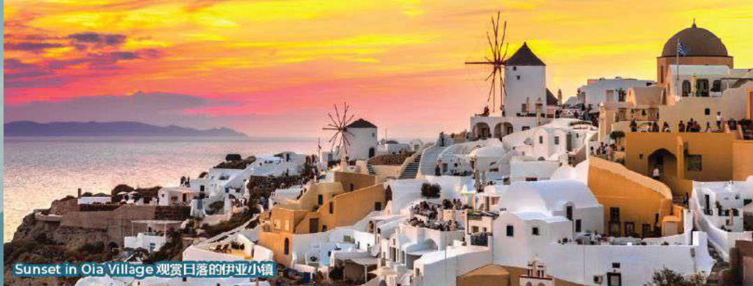
Sunset in Oia Village 观赏日落的伊业小镇