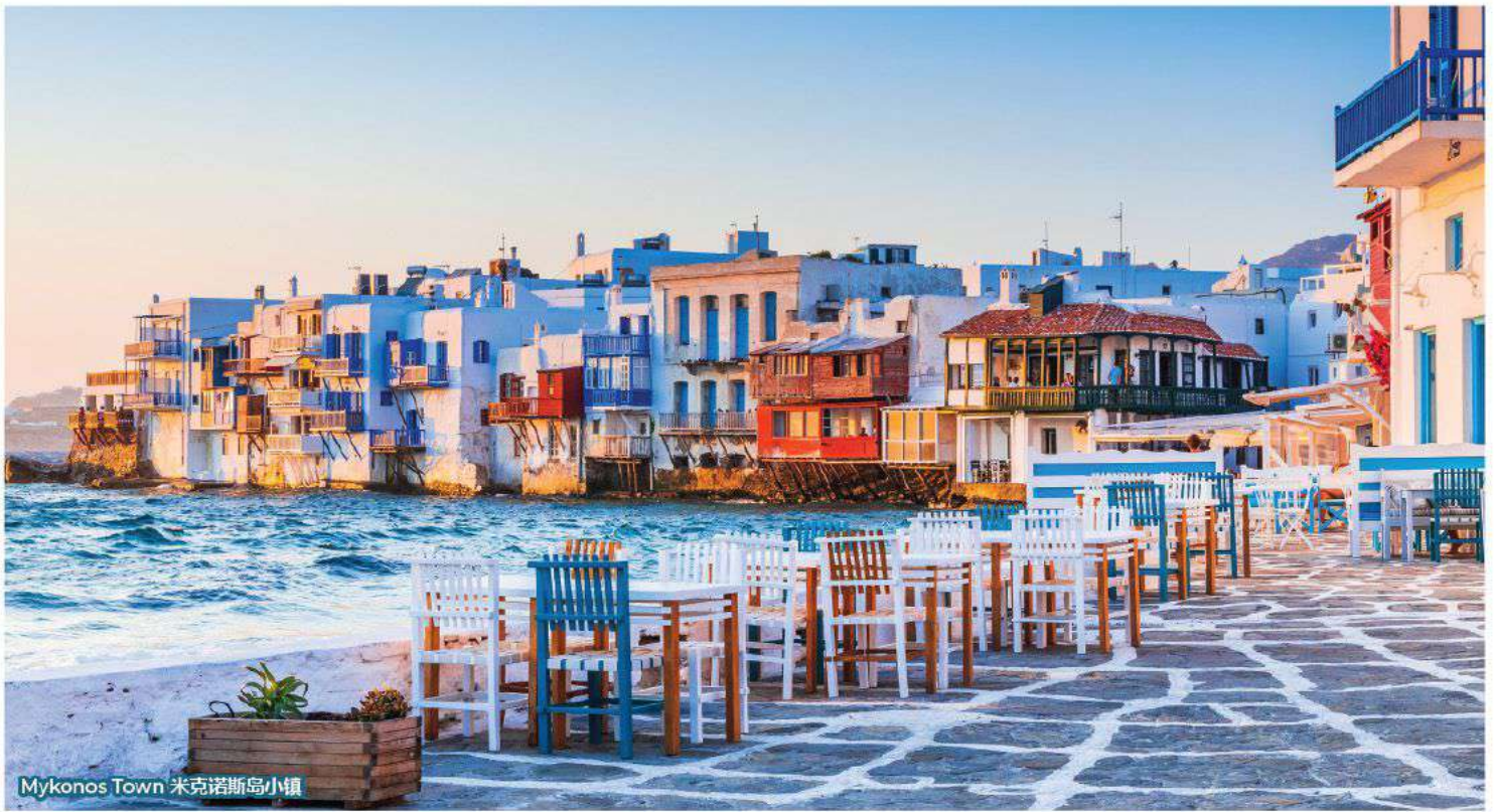
Mykonos Town 米克诺斯岛小镇