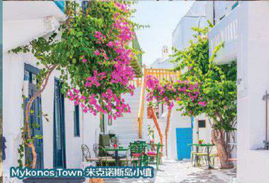
Mykonos Town 米克诺斯岛小镇