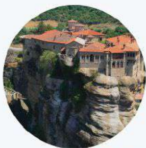
Meteora monasteries 迈泰奥拉修道院

The miracle of Greece. Few kilometers northwest of the town of Kalabaka, the impressive rocks of Meteora are rising from the plains of Thessaly been one of the most amazing places in Greece.