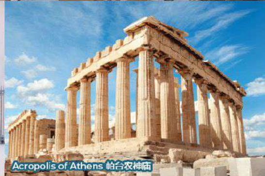
Acropolis of Athens 帕台农神庙