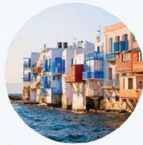
Little Venice 小威尼斯

Little Venice is a charming part of Mykonos. The water lapping up on the building is reminiscent of Venice.