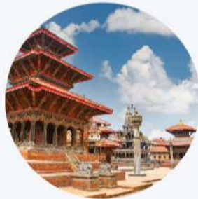
Bhaktapur Durbar Square 巴克塔普尔杜巴广场

The Temple of the Sacred Tooth Relic, or Sri Dalada Maligawa, is a Buddhist temple in Kandy, Sri Lanka. It is located in the royal palace complex of the former Kingdom of Kandy, which houses the relic of the tooth of the Buddha.