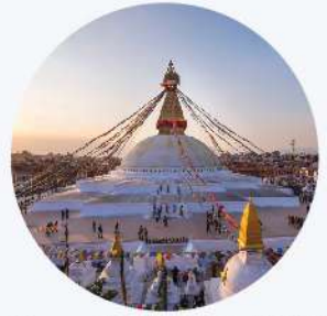
Great Stupa of Boudhanath 博拿佛塔

The Temple of the Sacred Tooth Relic, or Sri Dalada Maligawa, is a Buddhist temple in Kandy, Sri Lanka. It is located in the royal palace complex of the former Kingdom of Kandy, which houses the relic of the tooth of the Buddha.