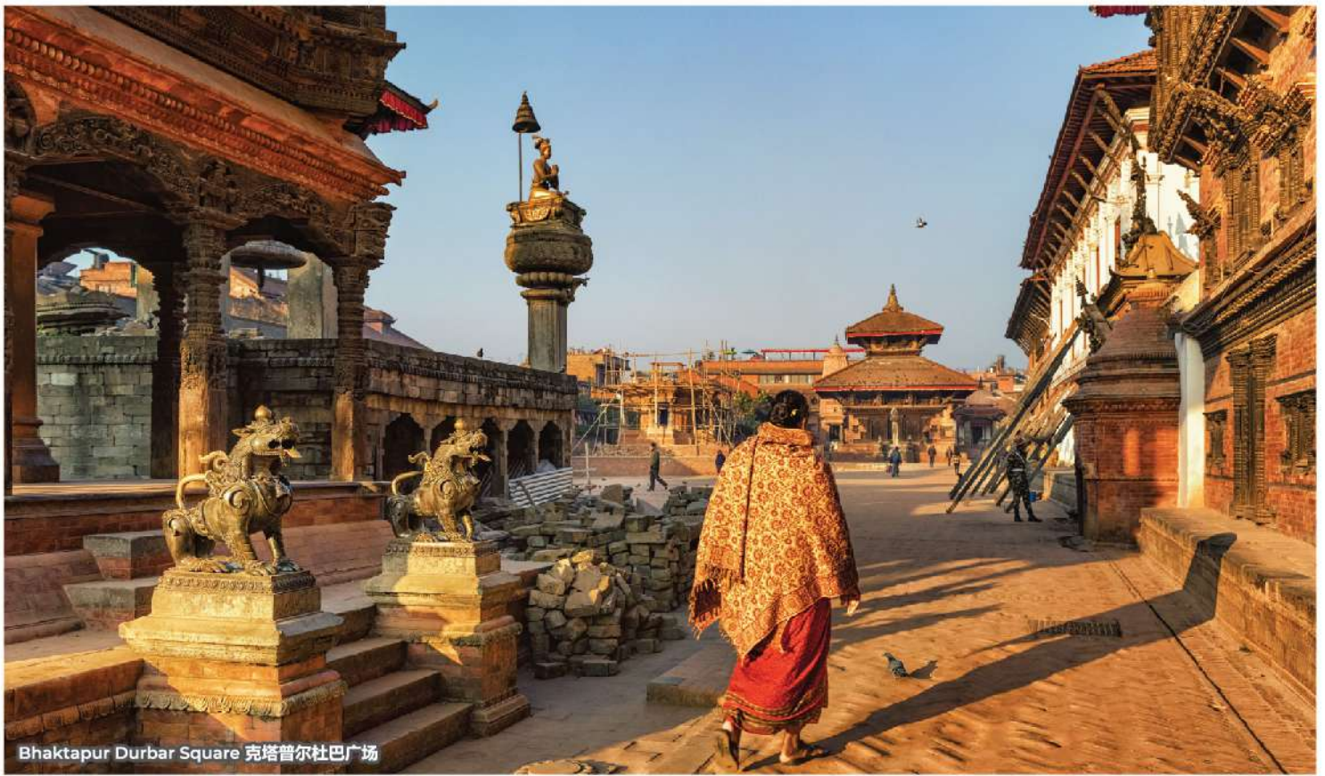
Bhaktapur Durbar Square 克塔普尔杜巴广场