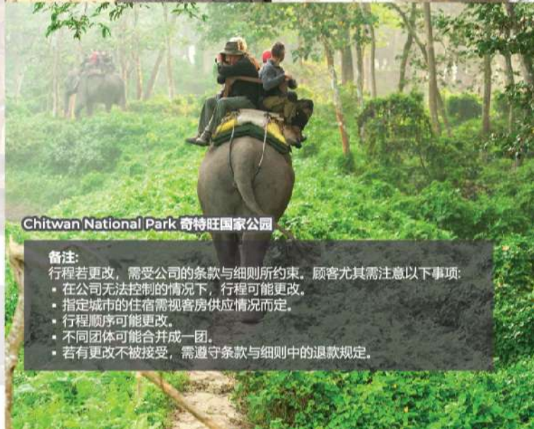
Chitwan National Park 奇特旺国家公园