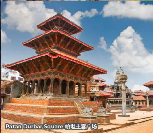
Patan Durbar Square 帕坦王宫广场