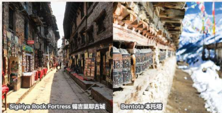
Sigiriya Rock Fortress 锡吉里耶古城