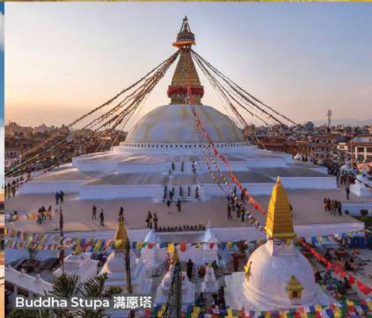
Buddha Stupa 满愿塔