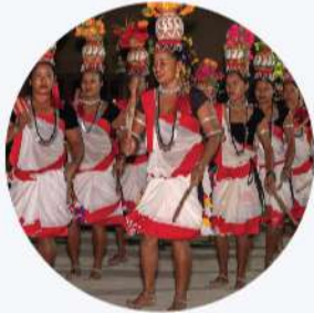
Tharu Cultural Performance 塔鲁文化表演

The Temple of the Sacred Tooth Relic, or Sri Dalada Maligawa, is a Buddhist temple in Kandy, Sri Lanka. It is located in the royal palace complex of the former Kingdom of Kandy, which houses the relic of the tooth of the Buddha.