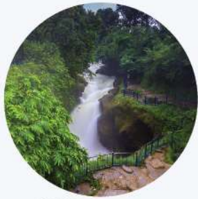
Devi's Fall 戴维斯瀑布

The Temple of the Sacred Tooth Relic, or Sri Dalada Maligawa, is a Buddhist temple in Kandy, Sri Lanka. It is located in the royal palace complex of the former Kingdom of Kandy, which houses the relic of the tooth of the Buddha.