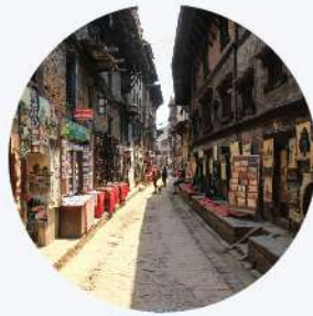
Thamel Street 塔美街

The Temple of the Sacred Tooth Relic, or Sri Dalada Maligawa, is a Buddhist temple in Kandy, Sri Lanka. It is located in the royal palace complex of the former Kingdom of Kandy, which houses the relic of the tooth of the Buddha.