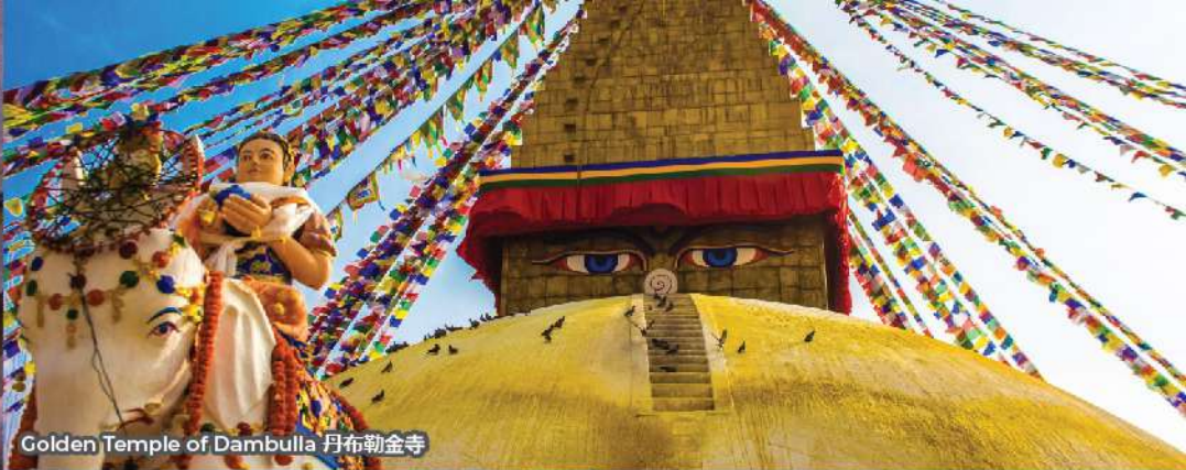
Golden Temple of Dambulla 丹布勒金寺