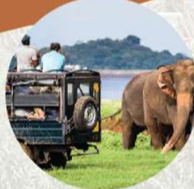
Jeep Safari at Yala National Park 雅拉国家公园吉普车探险

Fort (Colombo) is the central business district of Colombo in Sri Lanka. It is the financial district of Colombo and the location of the Colombo Stock Exchange and the World Trade Centre of Colombo from which the CSE operates. It is also the location of the Bank of Ceylon headquarters.