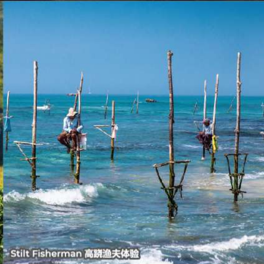
Stilt Fisherman 高跷渔夫体验