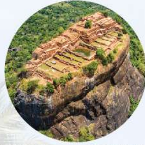
Sigiriya Rock Fortress 锡吉里耶古城

Sigiriya or Sinhagiri is an ancient rock fortress located in the northern Matale District near the town of Dambulla in the Central Province, Sri Lanka.