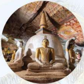
Golden Temple of Dambulla 丹布勒金寺

Sigiriya or Sinhagiri is an ancient rock fortress located in the northern Matale District near the town of Dambulla in the Central Province, Sri Lanka.