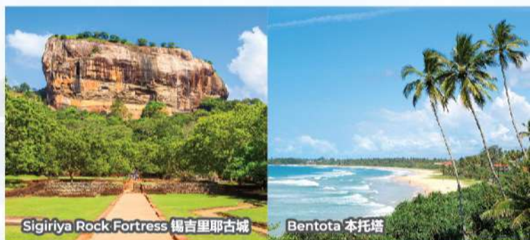
Sigiriya Rock Fortress 锡吉里耶古城