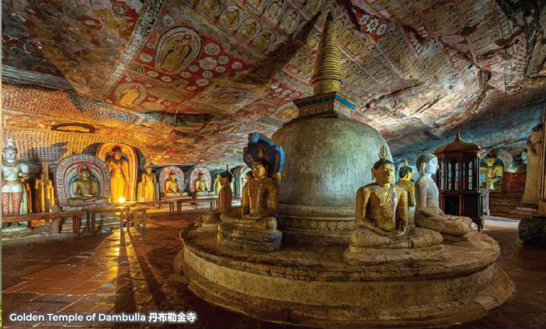
Golden Temple of Dambulla 丹布勒金寺