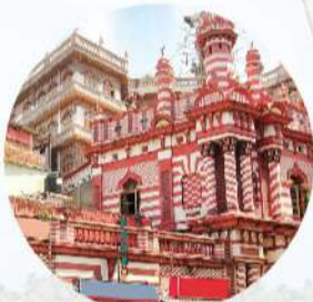
Colombo Fort 科伦坡城堡区

Fort (Colombo) is the central business district of Colombo in Sri Lanka. It is the financial district of Colombo and the location of the Colombo Stock Exchange and the World Trade Centre of Colombo from which the CSE operates. It is also the location of the Bank of Ceylon headquarters.