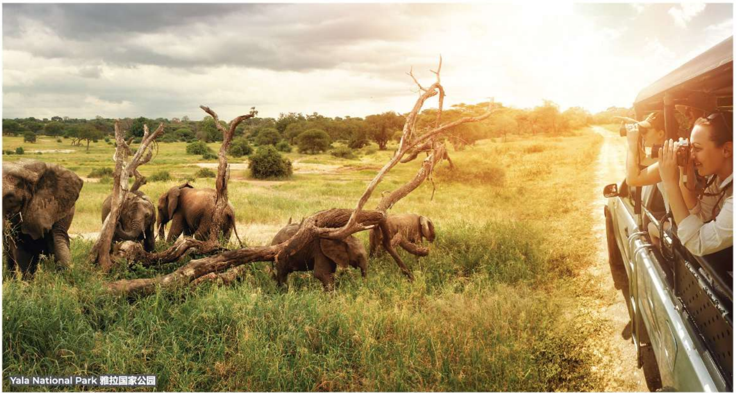
Yala National Park 雅拉国家公园