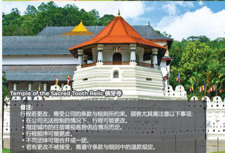
Temple of the Sacred Tooth Relic 佛牙寺