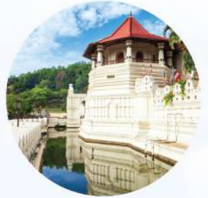
Temple of the Sacred Tooth Relic 佛牙寺

Dambulla cave temple also known as the Golden Temple of Dambulla is a World Heritage Site in Sri Lanka, situated in the central part of the country.