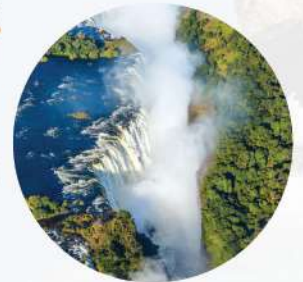
Victoria Falls 维多利亚瀑布

Victoria Falls is a waterfall on the Zambezi River in southern Africa, which provides habitat for several unique species of plants and animals.