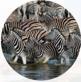
Chobe National Park 乔贝国家公园

Little Venice is a charming part of Mykonos. The water lapping up on the building is reminiscent of Venice.