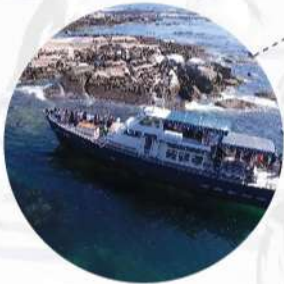
Seal Island 乘船到海豹岛

Seal Island in False Bay is wild, remote and spectacular. Not to be mistaken for Duiker Island near Hout Bay, Seal Island in False Bay is accessed by boat from Simonstown or Kalk Bay on Cape Town's Southern Peninsular.