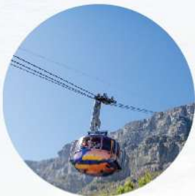
Cable Car Ride to Table Mountain 乘坐缆车登桌山

Victoria Falls is a waterfall on the Zambezi River in southern Africa, which provides habitat for several unique species of plants and animals.