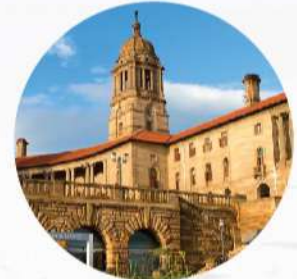
Union Buildings 联合大厦

Seal Island in False Bay is wild, remote and spectacular. Not to be mistaken for Duiker Island near Hout Bay, Seal Island in False Bay is accessed by boat from Simonstown or Kalk Bay on Cape Town's Southern Peninsular.