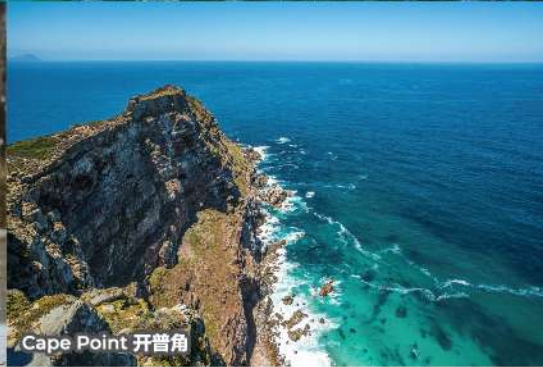
Cape Point 开普角