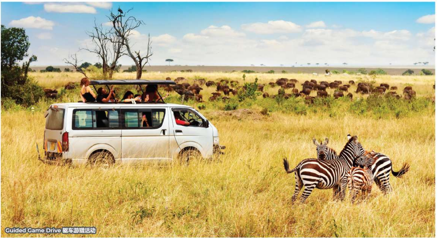
Guided Game Drive 驱车游猎活动