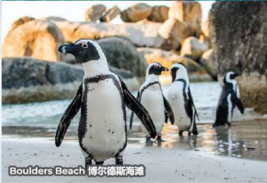
Boulders Beach 博尔德斯海滩