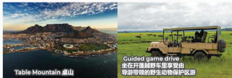
Table Mountain 桌山