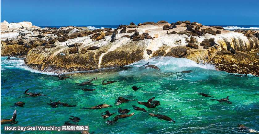
Hout Bay Seal Watching 乘船到海豹岛