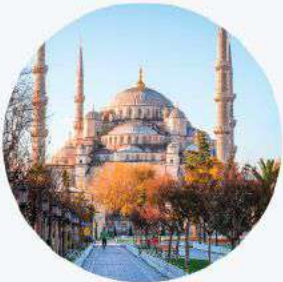
Blue Mosque 蓝色清真寺

The Blue Mosque in Istanbul, also known by its official name, the Sultan Ahmed Mosque, is an Ottoman-era historical imperial mosque located in Istanbul, Turkey.