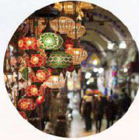
Grand Bazaar 大集市

The Blue Mosque in Istanbul, also known by its official name, the Sultan Ahmed Mosque, is an Ottoman-era historical imperial mosque located in Istanbul, Turkey.