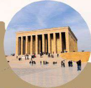
Ataturk Mausoleum 阿塔图尔克陵墓

Explore the Grand Bazaar, the largest and oldest shopping center in Istanbul, founded during the Ottoman Empire. With a local guide to help you, wander the 4000 shops and immerse yourself in a truly authentic experience of Turkish culture.