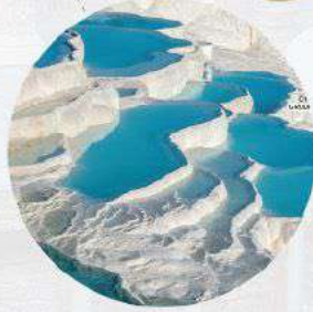
Cotton Palace 棉花堡

Ephesus is an ancient city in Turkey's Central Aegean region, near modern-day Selçuk. Its excavated remains reflect centuries of history, from classical Greece to the Roman Empire – when it was the Mediterranean's main commercial center – to the spread of Christianity.