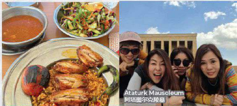
Ataturk Mausoleum 阿塔图尔克陵墓