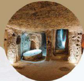
Underground City 地下城

Deriving from springs in a cliff almost 200 m high overlooking the plain of Cürüksu in south-west Turkey, calcite-laden waters have created an unreal landscape, made up of mineral forests, petrified waterfalls and a series of terraced basins given the name of Pamukkale (Cotton Palace).