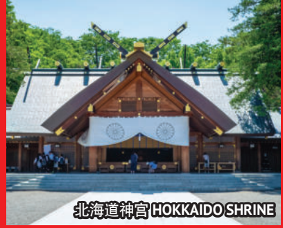
北海道神宮 HOKKAIDO SHRINE