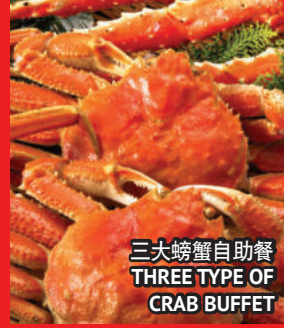
三大螃蟹自助餐 THREE TYPE OF CRAB BUFFET