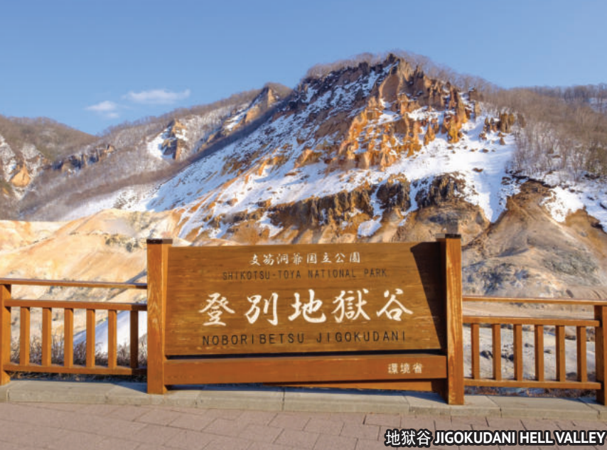
地獄谷 JIGOKUDANI HELL VALLEY