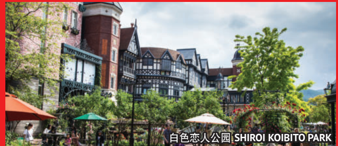
白色恋人公园 SHIROI KOIBITO PARK