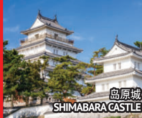
岛原城 SHIMABARA CASTLE