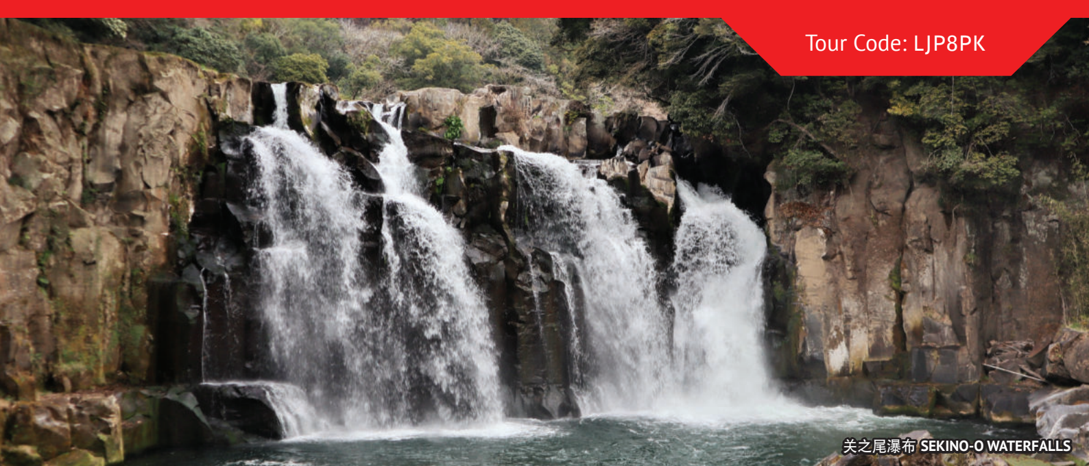
关之尾瀑布 SEKINO-O WATERFALLS