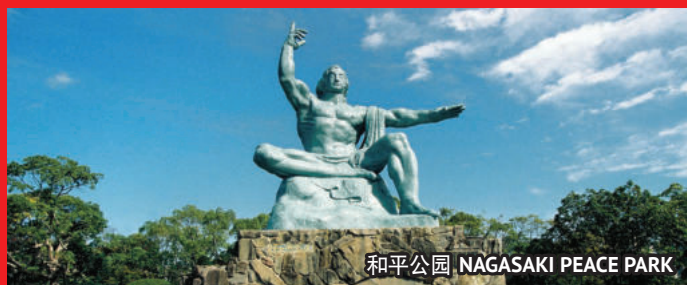
和平公园 NAGASAKI PEACE PARK