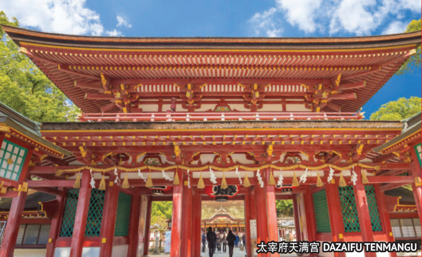
太宰府天满宫 DAZAIFU TENMANGU