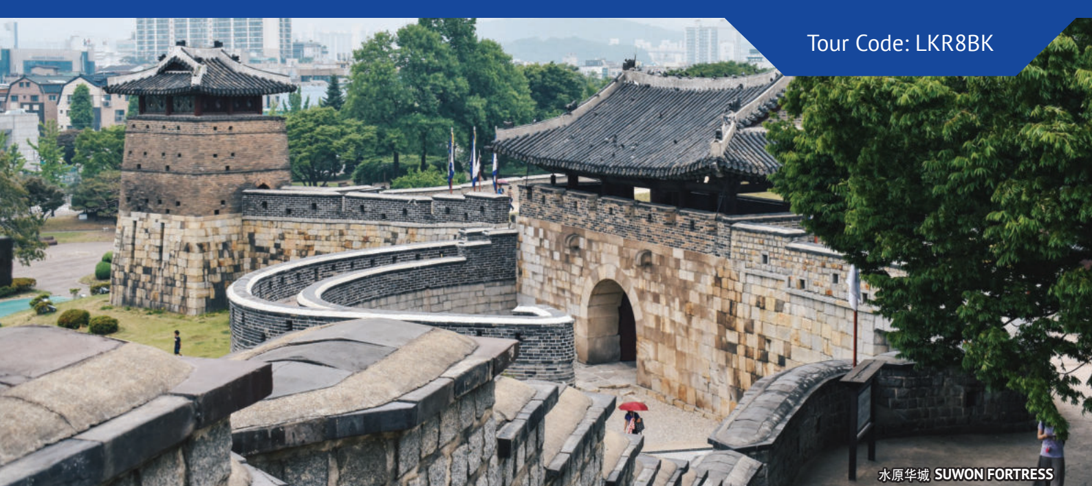
水原华城 SUWON FORTRESS