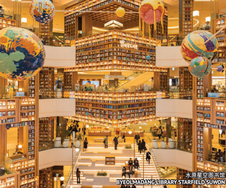
水原星空图书馆 BYEOLMADANG LIBRARY STARFIELD SUWON