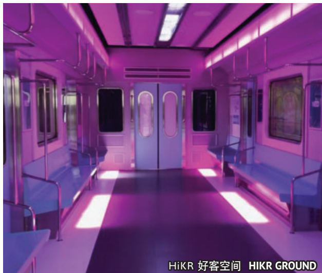
HiKR 好客空间 HiKR GROUND