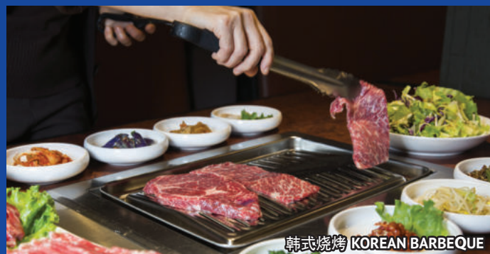
韩式烧烤 KOREAN BARBEQUE