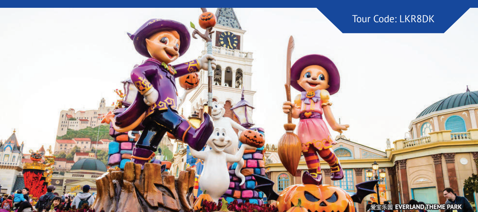
爱宝乐园 EVERLAND THEME PARK