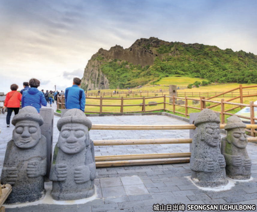
城山日出峰 SEONGSAN ILCHULBONG