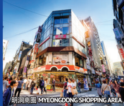
明洞商圈 MYEONGDONG SHOPPING AREA