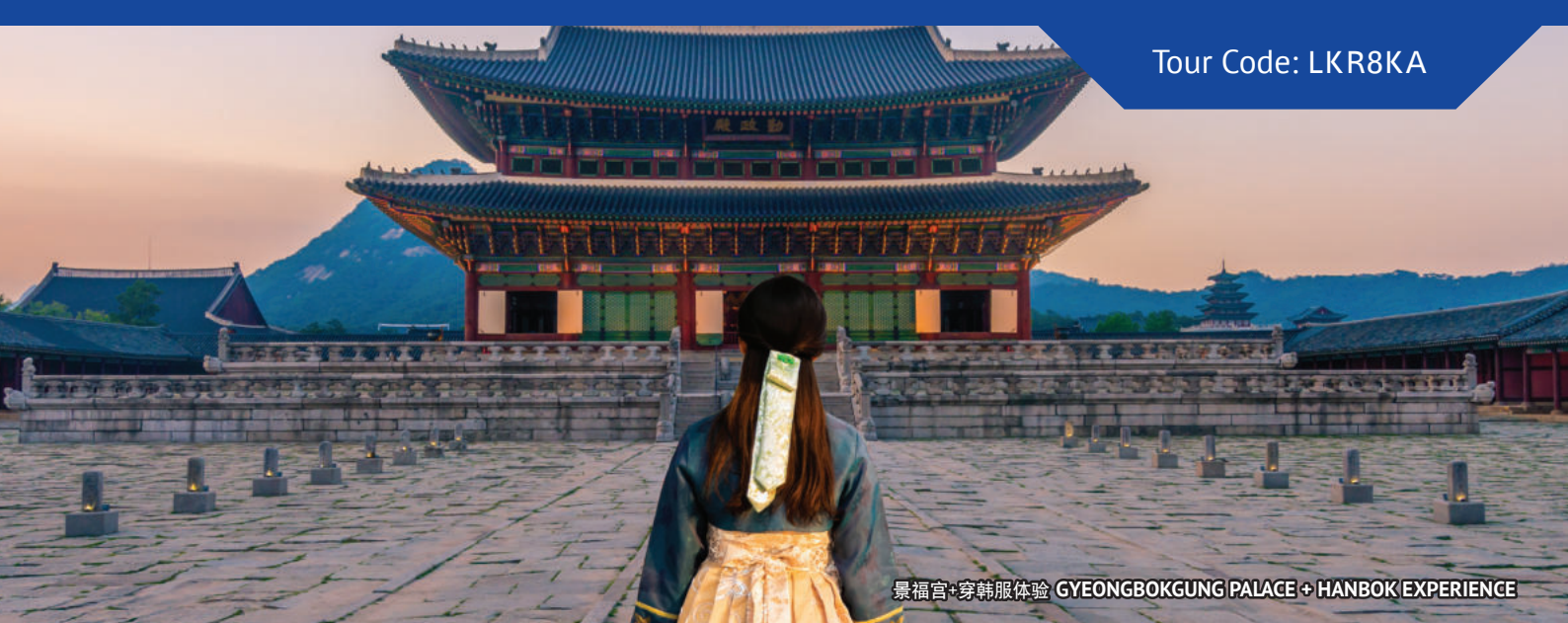
景福宫+穿韩服体验 GYEONBOKGUNG PALACE + HANBOK EXPERIENCE