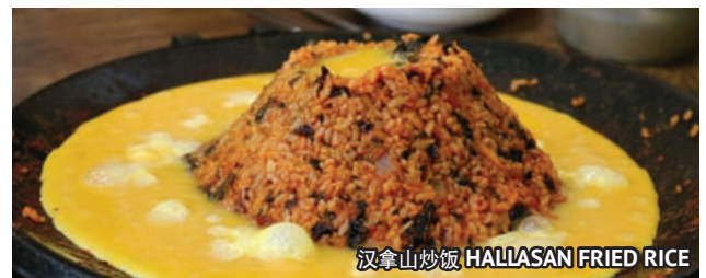
汉拿山炒饭 HALLASAN FRIED RICE