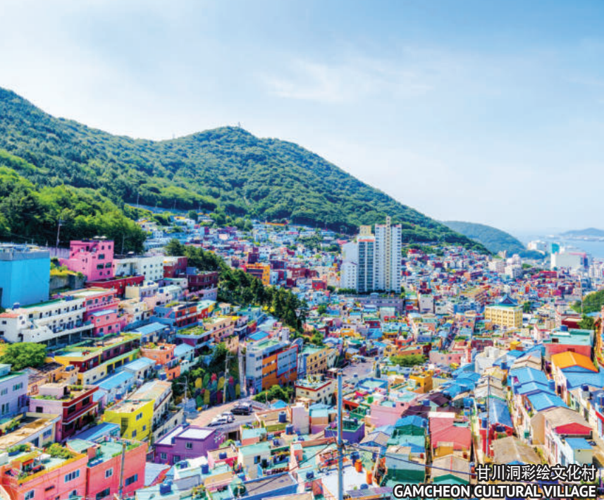
甘川洞彩绘文化村 GAMCHEON CULTURAL VILLAGE