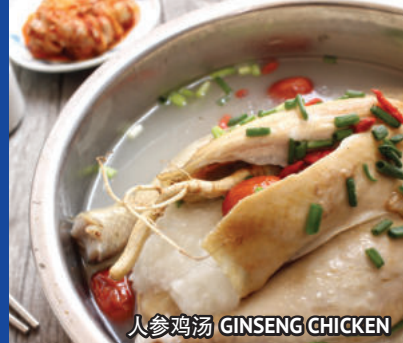
人参鸡汤 GINSENG CHICKEN