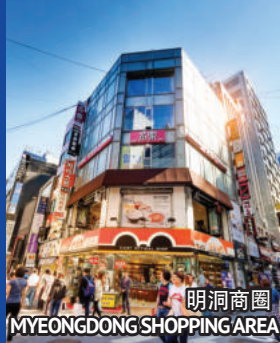
明洞商圈 MYEONGDONG SHOPPING AREA