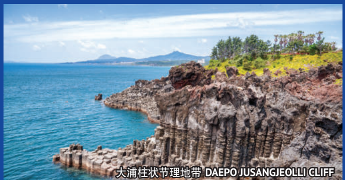
大浦柱状节理地带 DAEPO JUSANGJEOLLI CLIFF