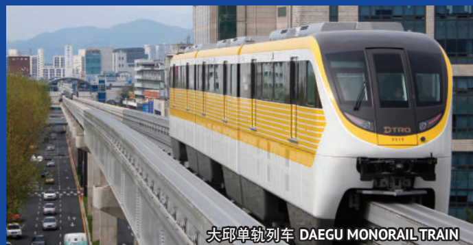
大邱单轨列车 DAEGU MONORAIL TRAIN