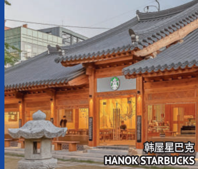
韩屋星巴克 HANOK STARBUCKS