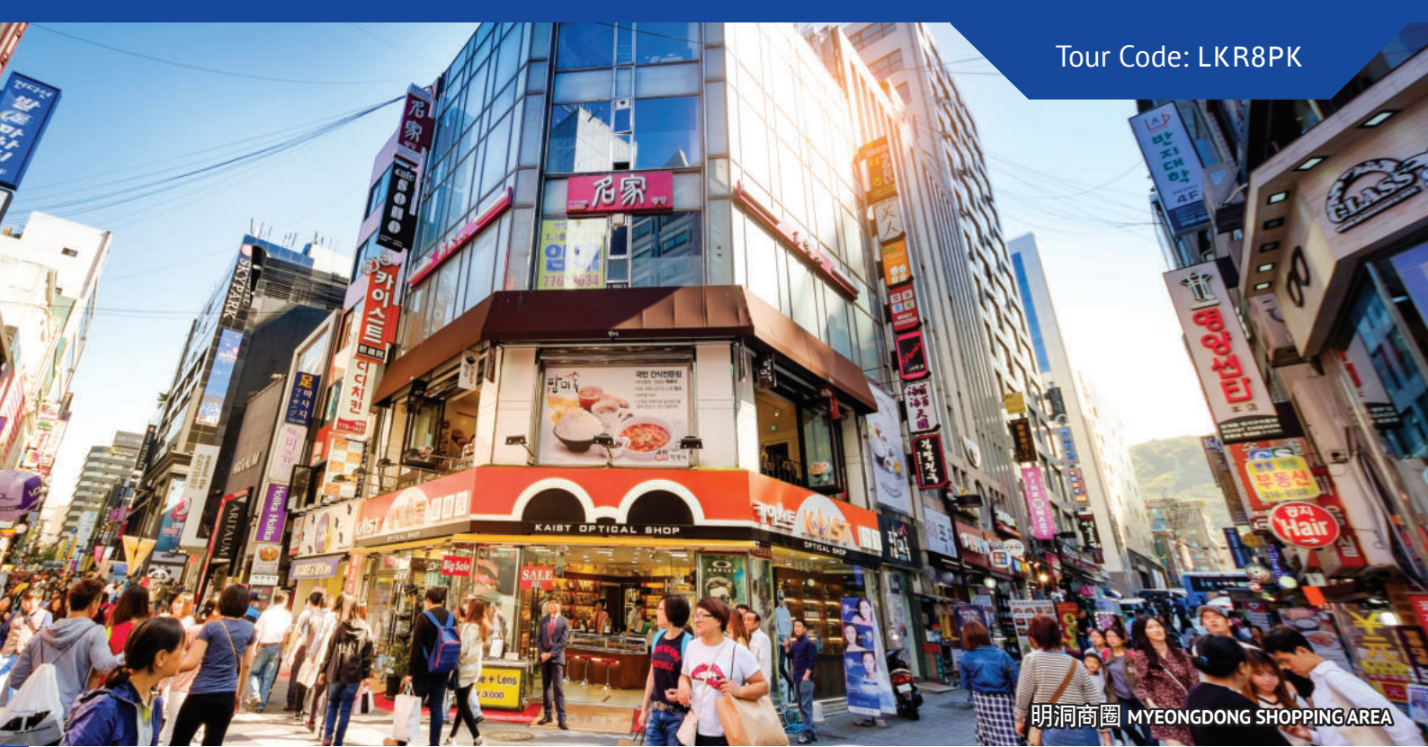
明洞商圈 MYEONGDONG SHOPPING AREA