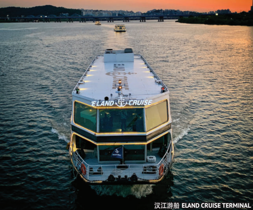
汉江游船 ELAND CRUISE TERMINAL