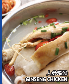
人参鸡汤 GINSENG CHICKEN