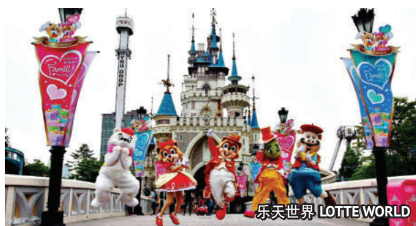
乐天世界 LOTTE WORLD