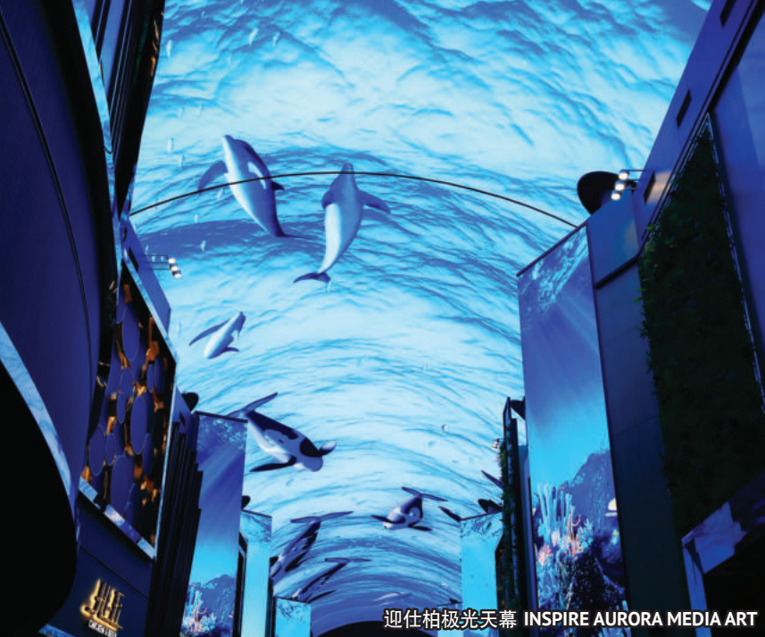
迎仕柏极光天幕 INSPIRE AURORA MEDIA ART