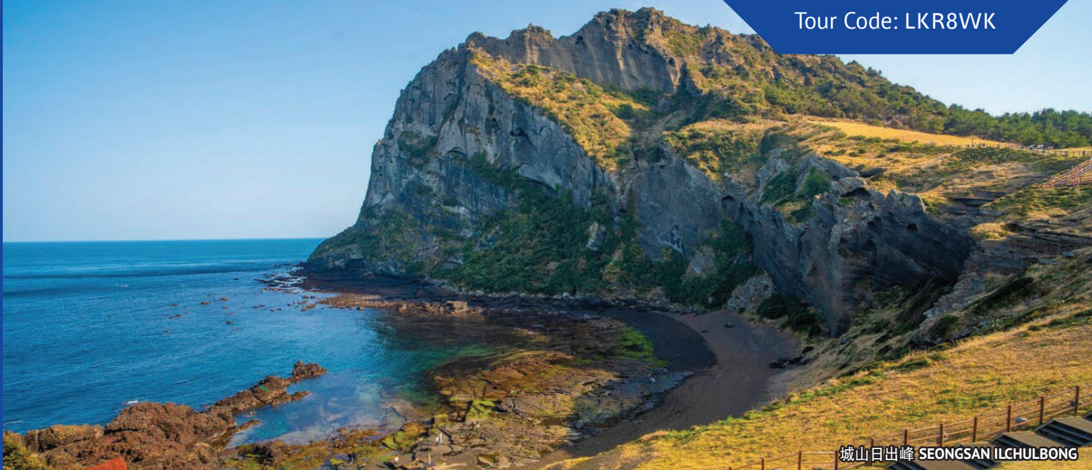
城山日出峰 SEONGSAN ILCHULBONG