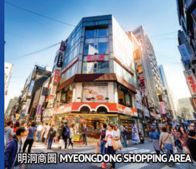
明洞商圈 MYEONGDONG SHOPPING AREA