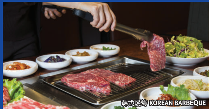
韩式烧烤 KOREAN BARBEQUE