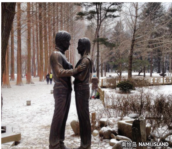
南怡島 NAMI ISLAND