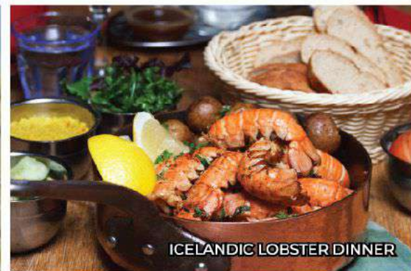
ICELANDIC LOBSTER DINNER

Today, head to Blue Lagoon . Here, you can enjoy a rejuvenating dip at the world-renowned Blue Lagoon geothermal spa , famous for its mineral-rich seawater and silica mud, before savouring a delightful lagoon drink . This evening, enjoy an interesting culinary experience with a Viking Dinner where traditional Icelandic meals will be served in an authentic Viking-style.