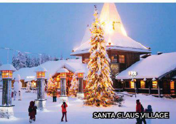
SANTA CLAUS VILLAGE

Spend the day at leisure. You may wish to join an optional Tallinn city tour and explore the walled cobblestoned Old Town of Estonia's capital at your own expense.