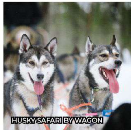
HUSKY SAFARI BY WAGON