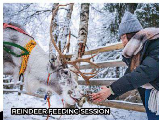
REINDEER FEEDING SESSION