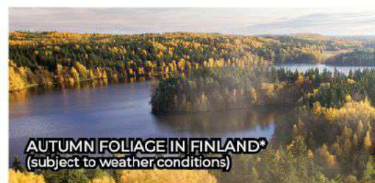
AUTUMN FOLIAGE IN FINLAND* (subject to weather conditions)