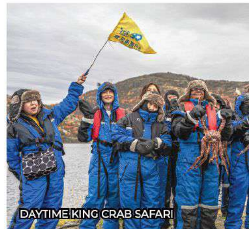
DAYTIME KING CRAB SAFARI

Note: Northern Lights is a natural phenomenon and sighting is subject to weather conditions