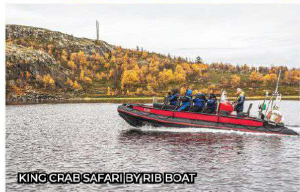
KING CRAB SAFARI BY RIB BOAT