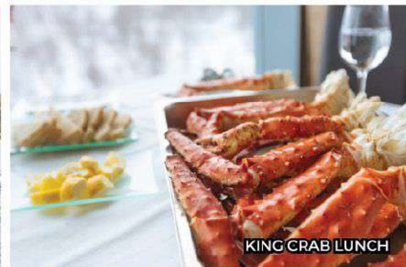
KING CRAB LUNCH

Note: Northern Lights is a natural phenomenon and sighting is subject to weather conditions