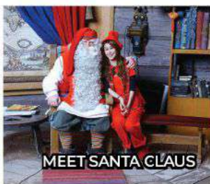
MEET SANTA CLAUS