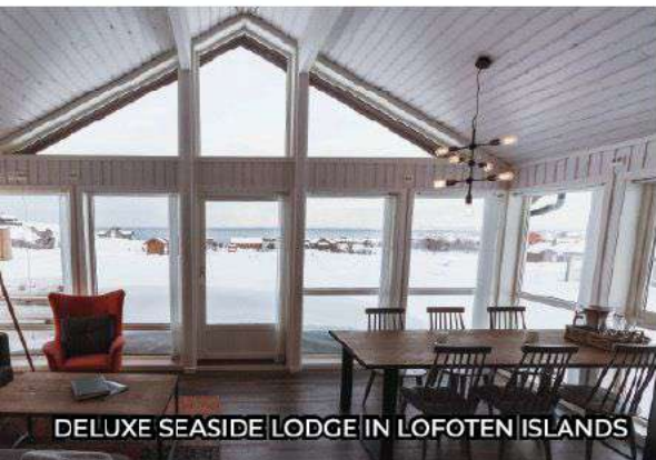
DELUXE SEASIDE LODGE IN LOFOTEN ISLANDS

If time permits, you can do some last-minute shopping before you transfer to the airport for your flight home.