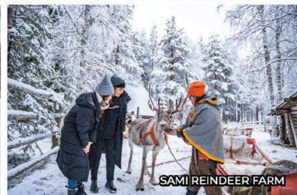
SAMI REINDEER FARM

This morning, embark on a city tour to discover the city's architectural masterpiece, Arctic Cathedral . Head to Tromsø Cathedral , one of the largest wooden cathedrals in Norway built in the Gothic Revival style. Take the Fjellheisen cable car ride up to Mt Storsteinen , for a panoramic view of Tromsø. Later, visit a Sami reindeer farm , where you will have the chance to meet and feed the reindeers. Savour traditional Sami food in a lavvu, the Sami equivalent of a Native American tepee, and listen to stories about the Sami culture from traditional reindeer herders.