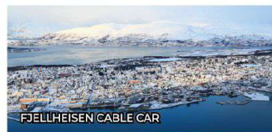
FJELLHEISEN CABLE CAR