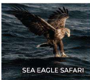
SEA EAGLE SAFARI