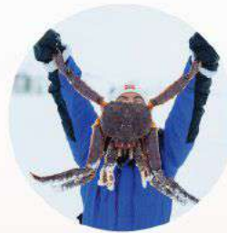
King Crab Safari

The Amethyst Mine atop Lampivaara Hill offers a unique opportunity to mine your own amethyst in the heart of Lapland. Located in Luosto, this scenic spot is surrounded by the breathtaking beauty of Pyhä-Luosto National Park.