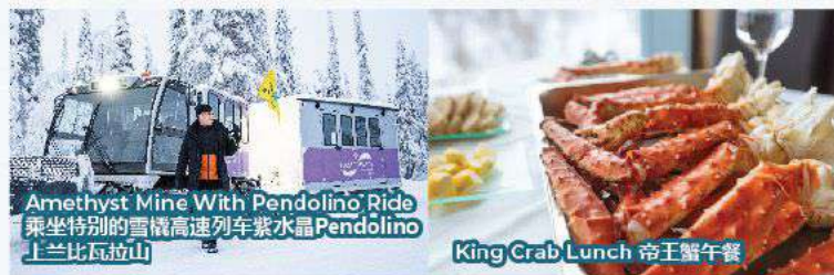
Amethyst Mine With Pendolino Ride 乘坐特别的雪橇高速列车紫水晶 Pendolino 上兰比瓦拉山