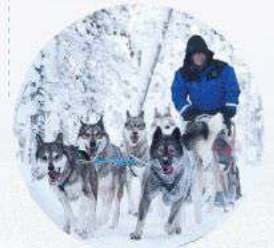
Husky Sled Safari

Embark on the ultimate king crab safari, where you will journey across the frozen fjord on a snowmobile sleigh ride and learn how to catch this giant king crab. After which, enjoy a scrumptious king crab lunch.