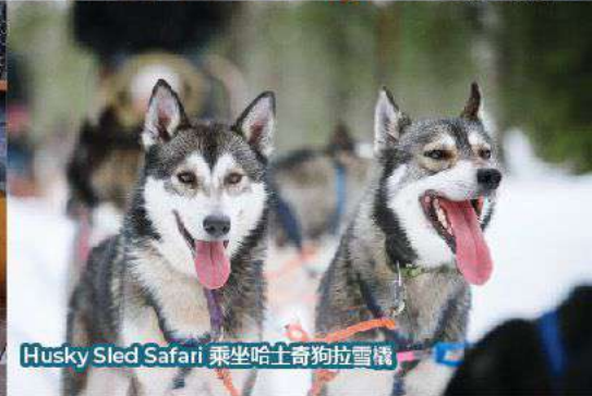
Husky Sled Safari 乘坐哈士奇狗拉雪橇