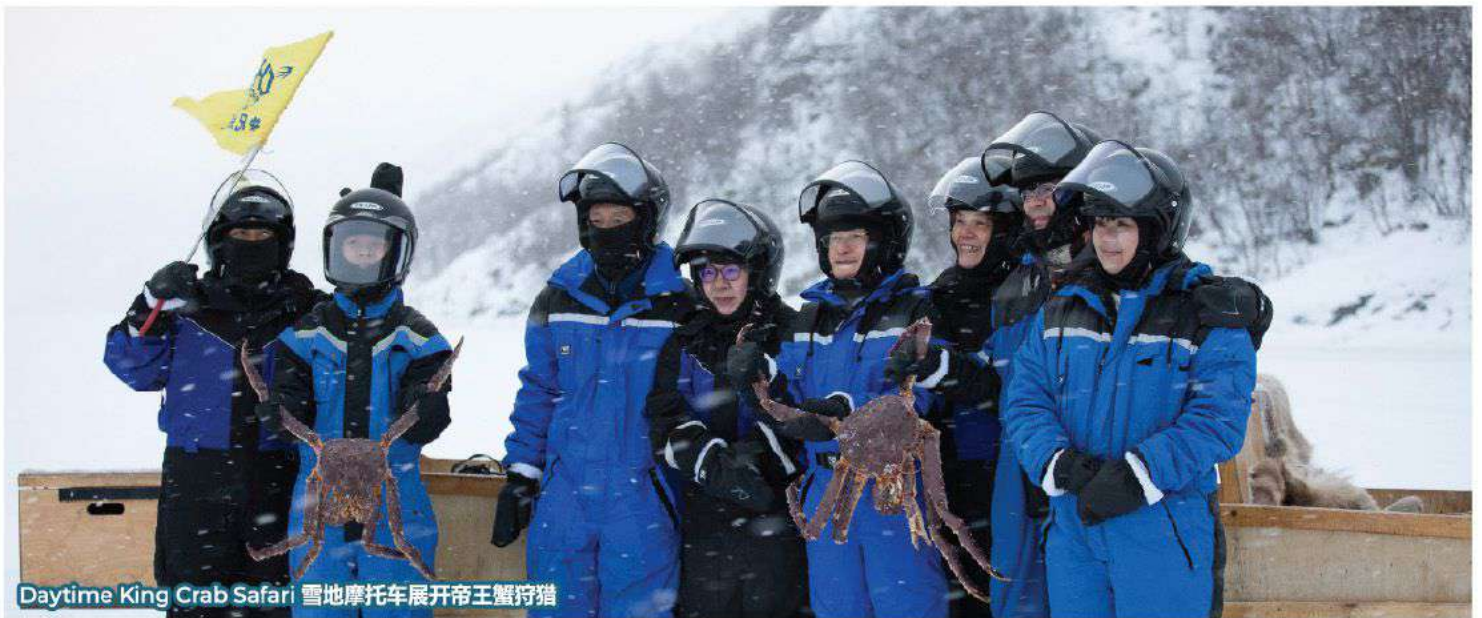
Daytime King Crab Safari 雪地摩托车展开帝王蟹狩猎