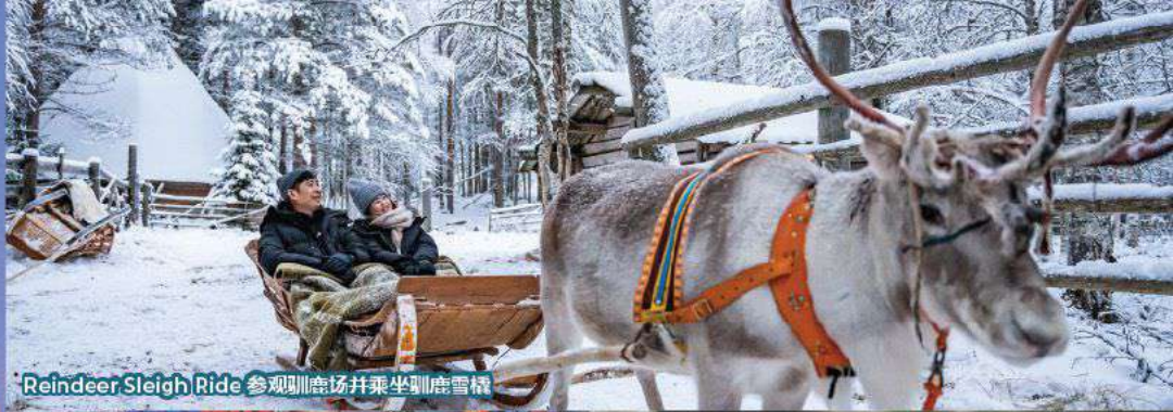
Reindeer Sleigh Ride 参观驯鹿场并乘坐驯鹿雪橇