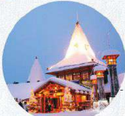
Santa Claus Village

After a day of exploring, take some time to stroll through the charming village, where you'll find cozy cafés, local boutiques, and charming shops offering traditional Finnish souvenirs.