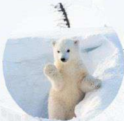
Ranua Wildlife Park

Step into a magical world, located right on the Arctic Circle. Meet Santa Claus in his lodge, and have your memorable photo taken. Drop by the Santa Claus Main Post Office, where you can send festive greetings to loved ones back home with the official Arctic Circle stamp. It's the perfect place to experience Christmas magic year-round.