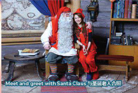
Meet and greet with Santa Claus 与圣诞老人合照