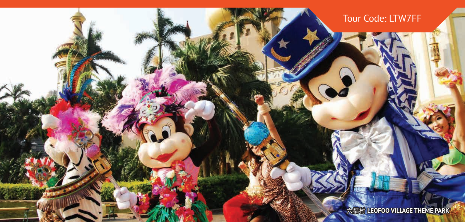
六福村 LEOFOO VILLAGE THEME PARK