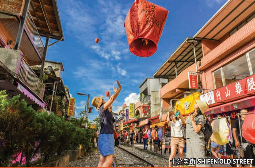
十分老街 SHIFEN OLD STREET