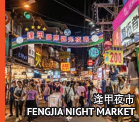
逢甲夜市 FENGJIA NIGHT MARKET