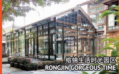
榕锦生活时光园区 RONGJIN GORGEOUS TIME