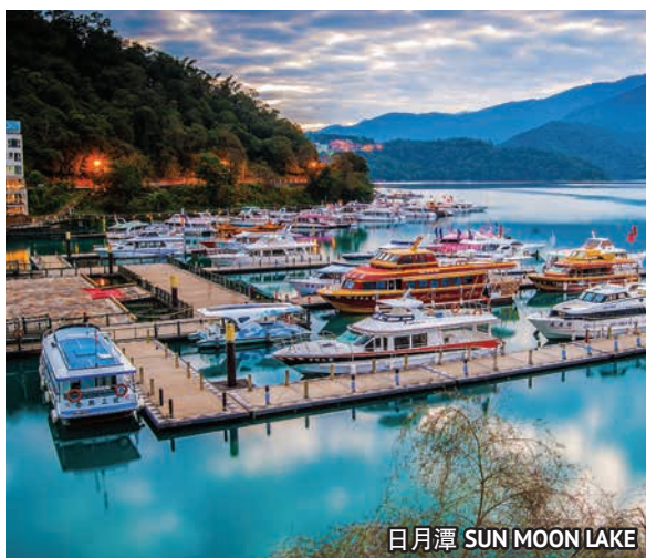
日月潭 SUN MOON LAKE